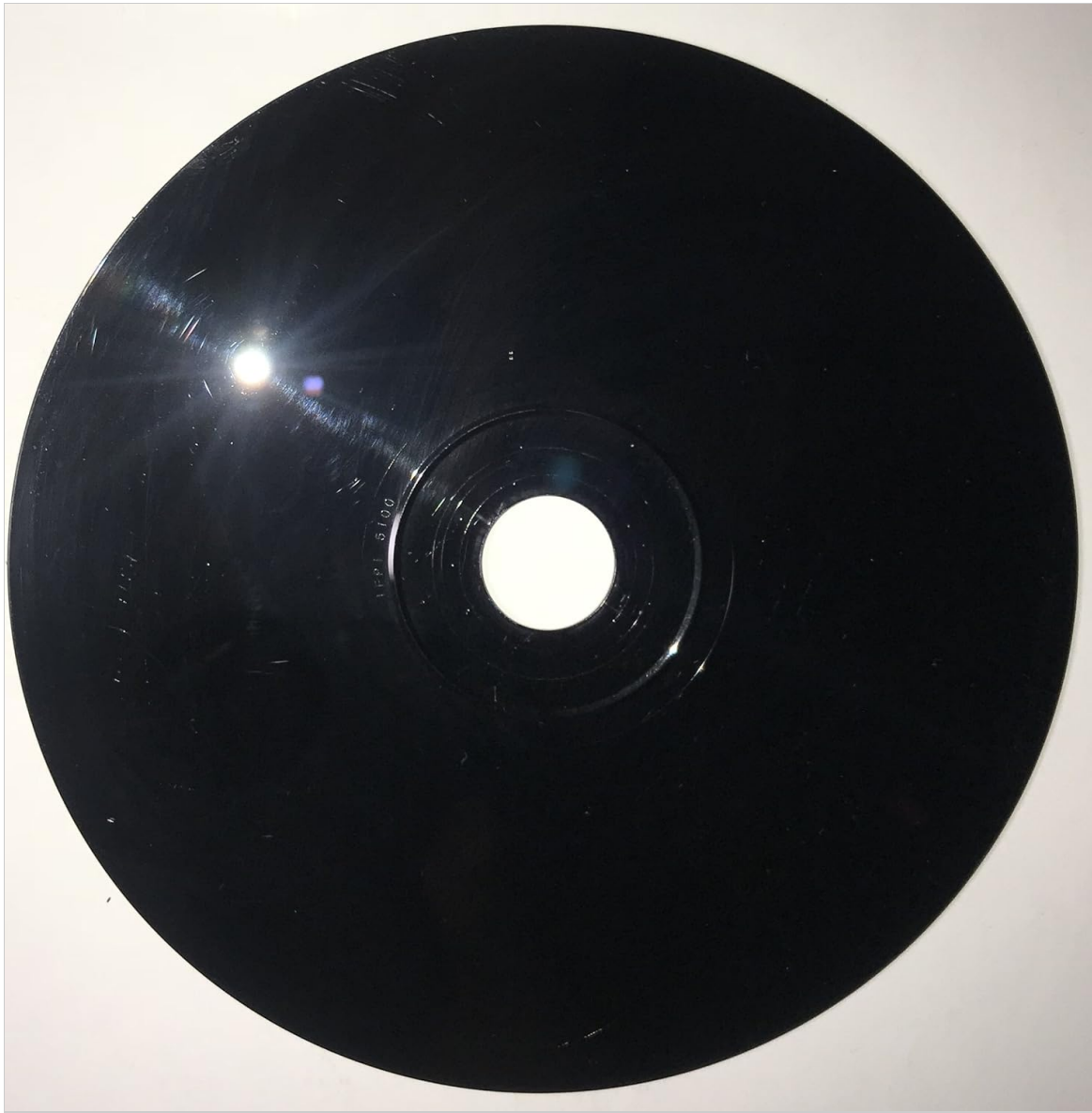
Image: The underside of a black PlayStation game disc, which should be kept clean and scratch-free for proper game function.