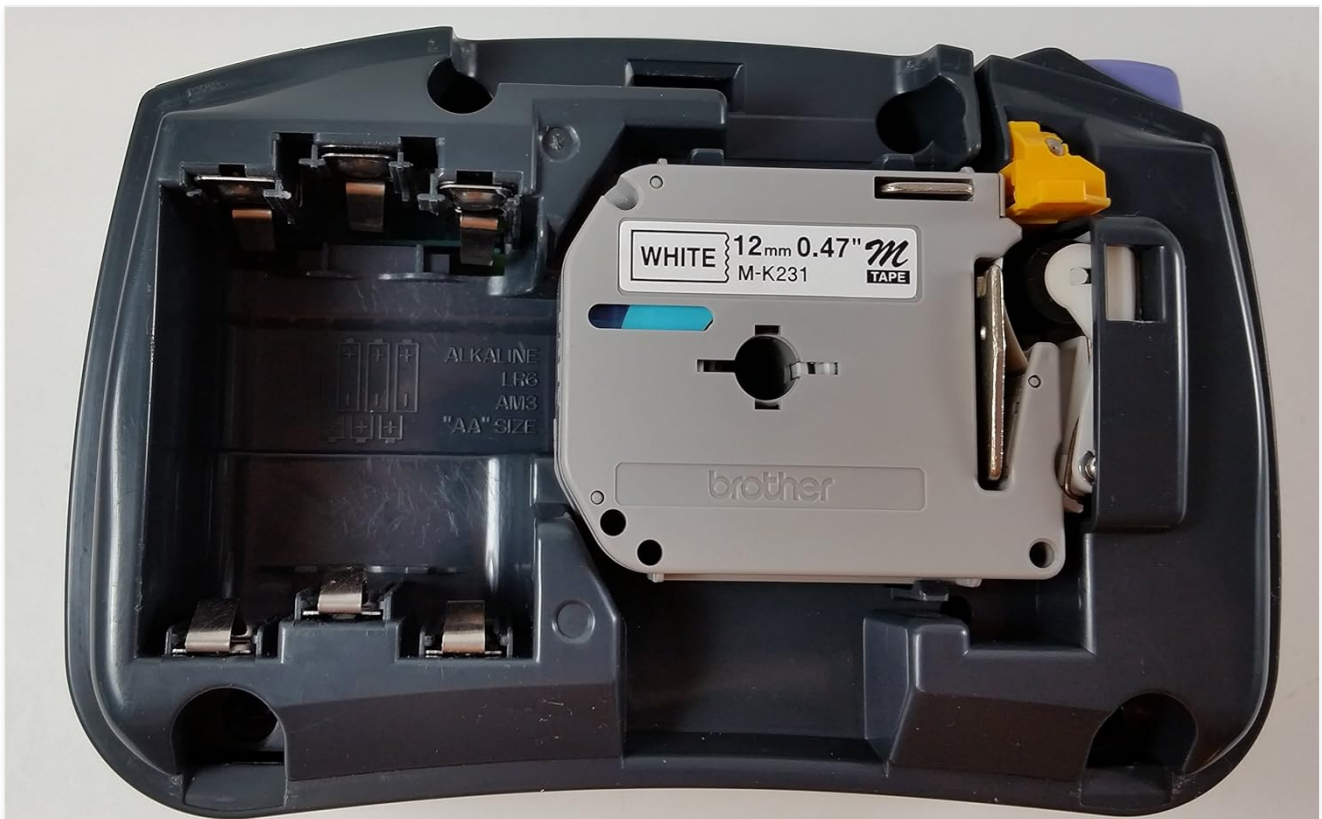
Image: Inside view of the Brother PT-65 P-touch Labeler, showing the tape cartridge correctly inserted and the battery compartment.