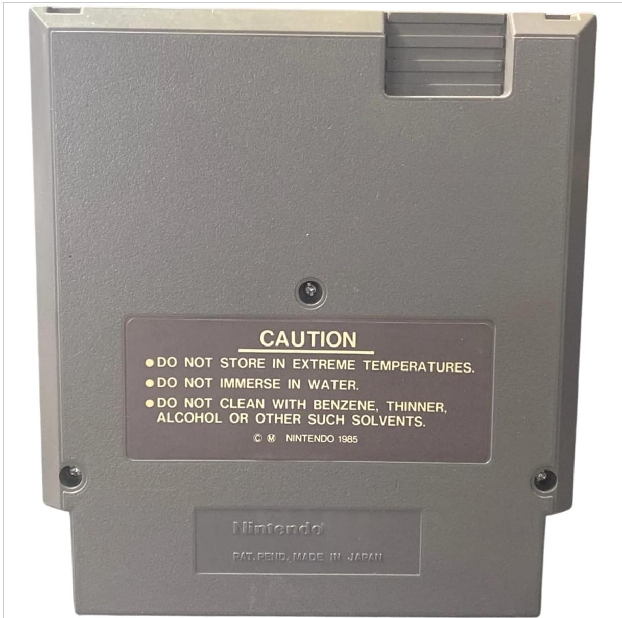
Image: Back view of the Mega Man NES game cartridge, showing the caution label with important handling instructions.

Proper care of your Mega Man game cartridge will ensure its longevity and reliable performance. Refer to the caution label on the back of the cartridge for important guidelines.