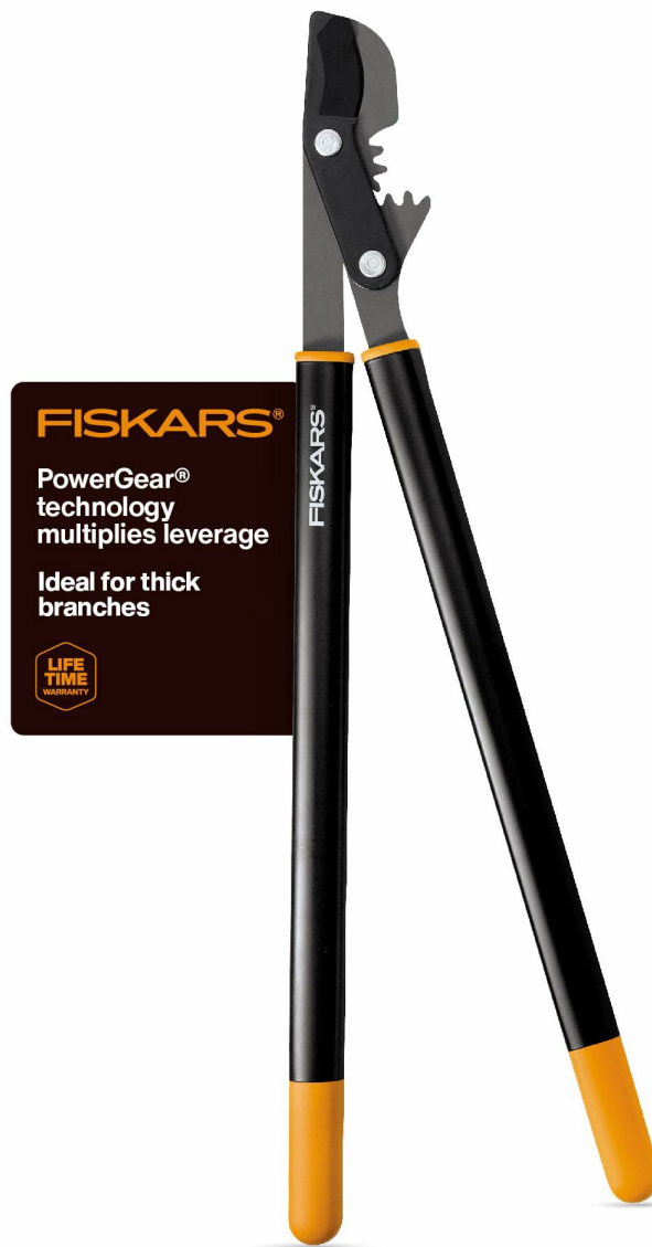
Figure 1: Fiskars 32" PowerGear Bypass Loppers.