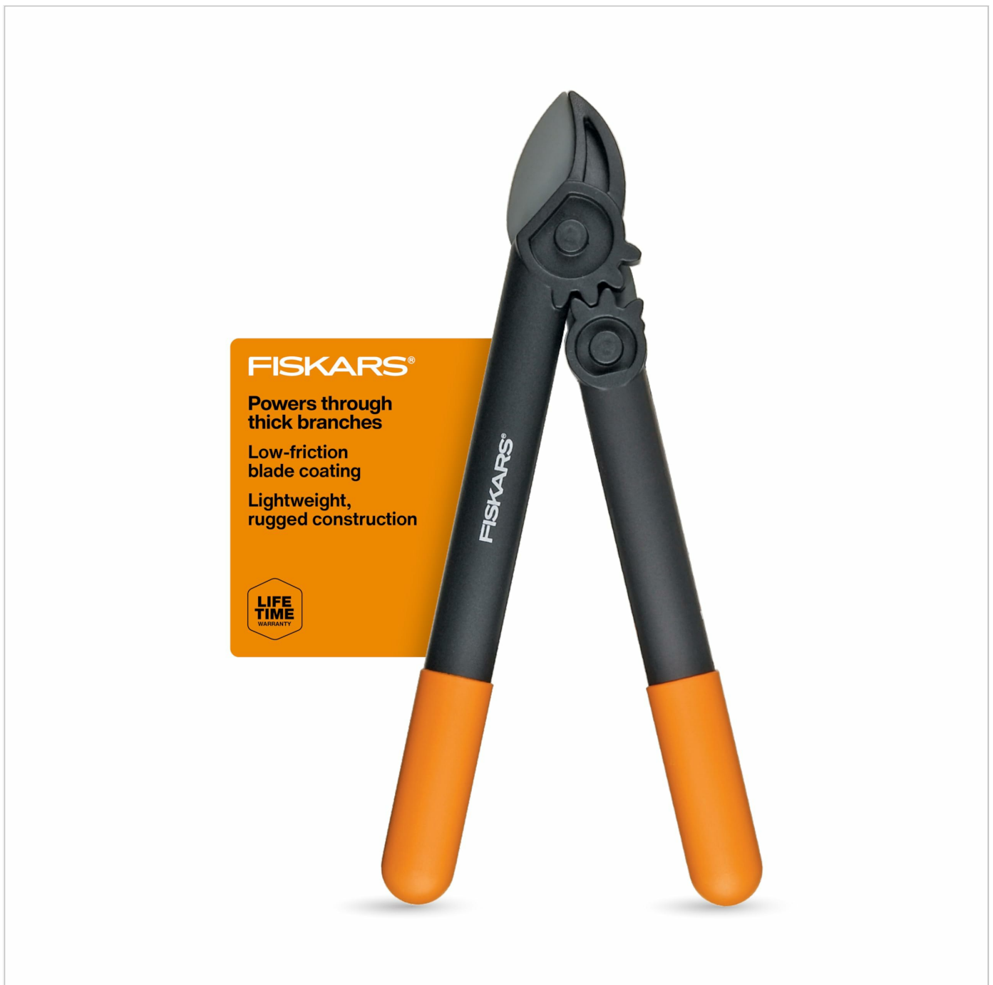
Image: The Fiskars 15-Inch PowerGear Loppers, showcasing their compact design.