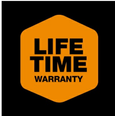
Image: Official Lifetime Warranty badge from Fiskars.

The Fiskars 15-Inch PowerGear Loppers come with a Full Lifetime Warranty . Fiskars tools are designed for longevity and guaranteed to maintain exceptional performance season after season. For detailed information and to register your product, please visit the official Fiskars website or refer to the warranty card included with your product.