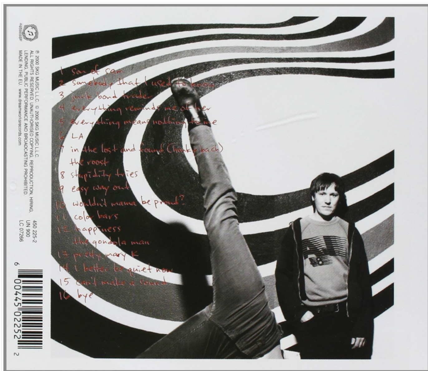
Figure 8 Album Back Cover: This image shows the back cover of the "Figure 8" Audio CD, which includes the album's tracklist and a continuation of the spiral design, featuring an inverted image of Elliott Smith.