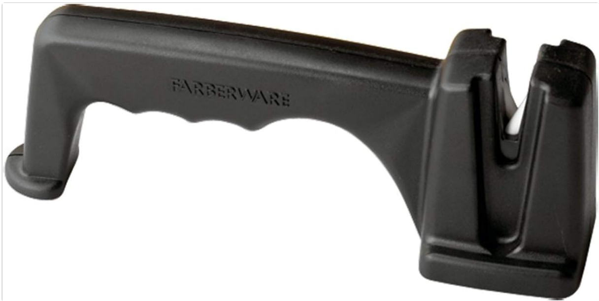
Image 2.1: The sharpener positioned on a cutting board, ready for use.