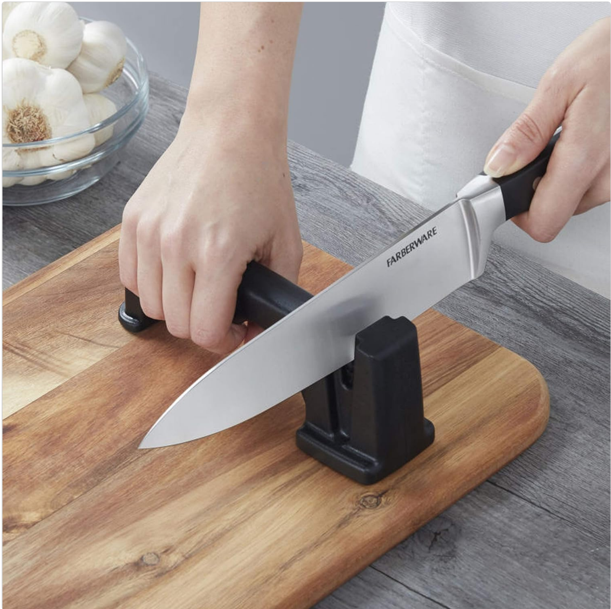
Image 3.2: The knife sharpener in active use, demonstrating proper technique.