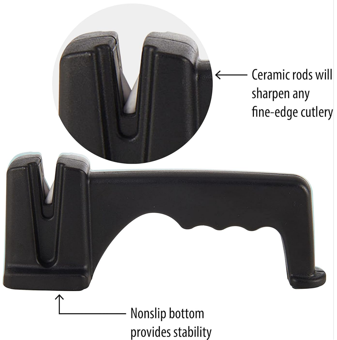
Image 1.2: Diagram highlighting the ceramic sharpening rods and the non-slip base for stability.