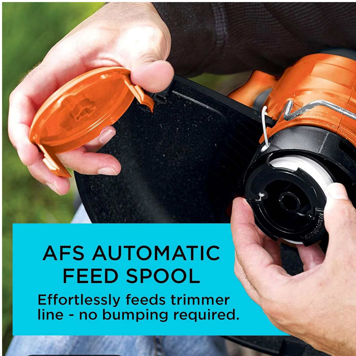
Image: A hand demonstrates the removal of the trimmer head cap and the old spool.