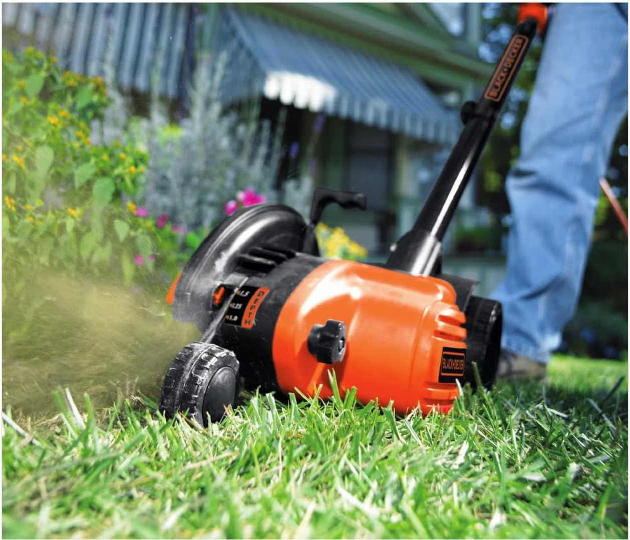
Image: A close-up view of the BLACK+DECKER LE750 edger, highlighting the visible depth adjustment settings on the side of the tool.