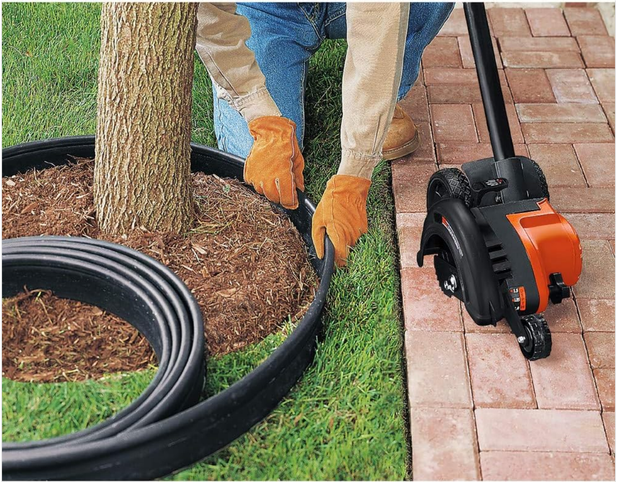
Image: The BLACK+DECKER LE750 Edger and Trencher with its handle attached, ready for use.

The BLACK+DECKER LE750 is designed for tool-free assembly. Simply connect the handle sections and secure them according to the instructions provided in the packaging. Ensure all connections are firm before operation.