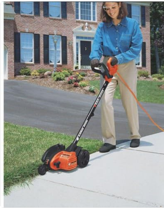
Image: A woman is shown operating the BLACK+DECKER LE750 edger, creating a clean edge along a concrete sidewalk.