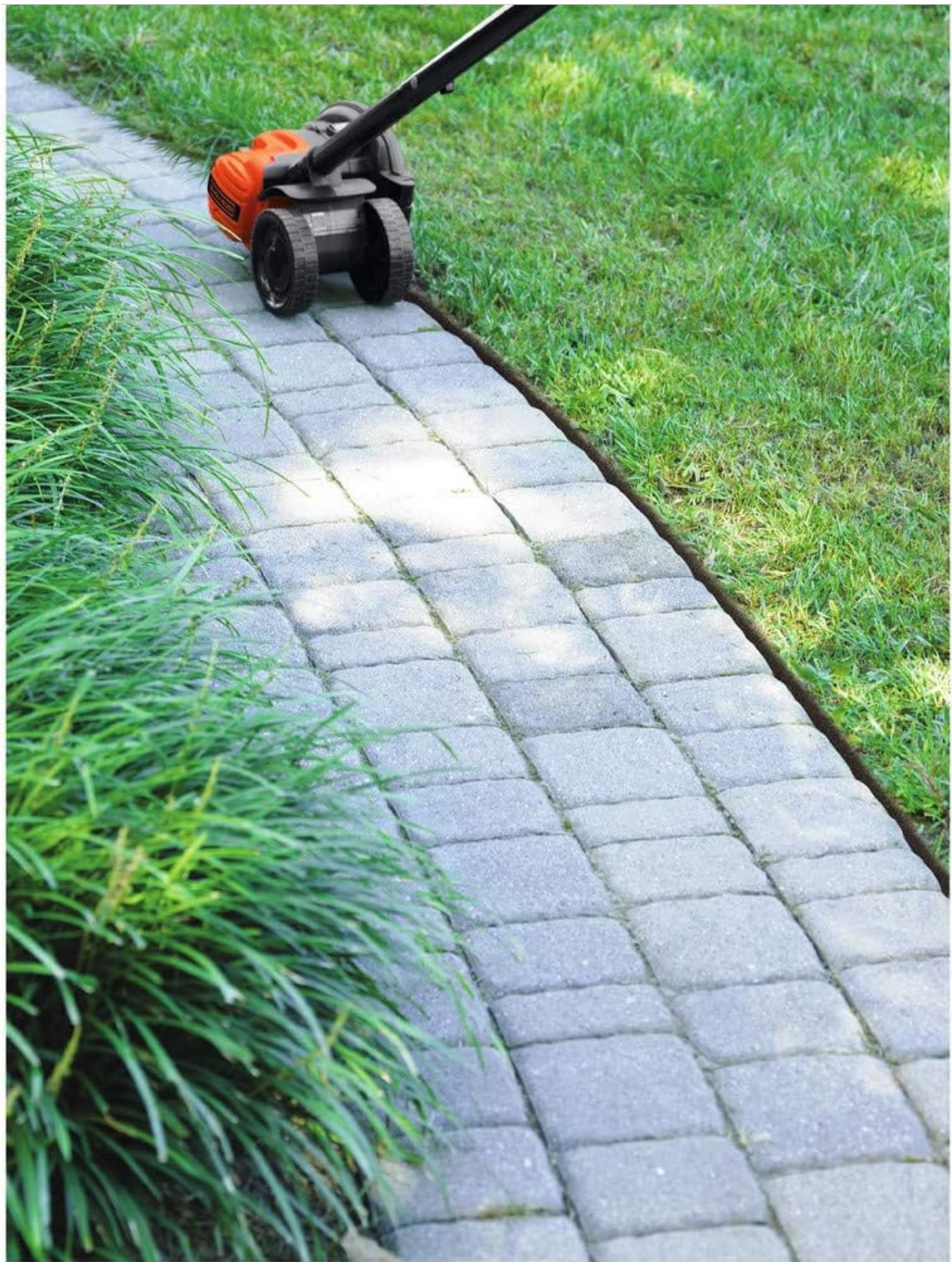
Image: The BLACK+DECKER LE750 edger is used to create a precise and clean line along the edge of a paved walkway, separating it from the lawn.