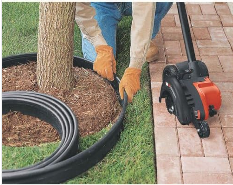
Image: The BLACK+DECKER LE750 edger is shown creating a trench around the base of a tree, demonstrating its landscape trenching capability.