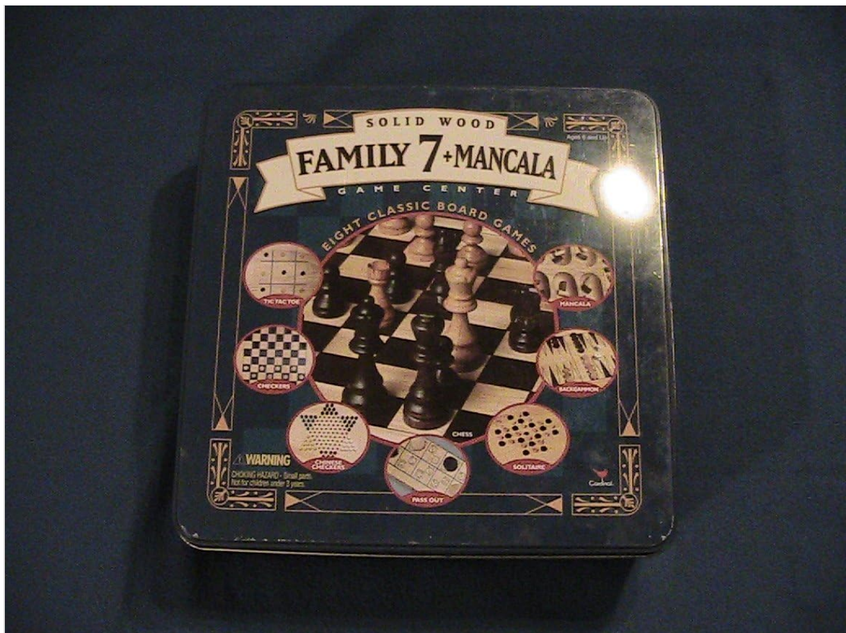
Image: The closed tin of the Cardinal Family 7+ Mancala Game Center, showcasing the various games included on its lid.