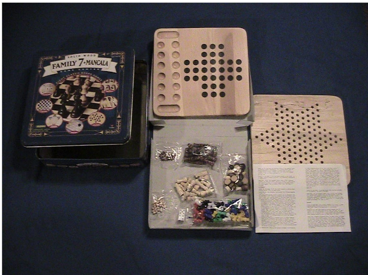
Image: The contents of the Cardinal Family 7+ Mancala Game Center, including the game boards, various game pieces in bags, and instruction sheets, laid out next to the open tin.