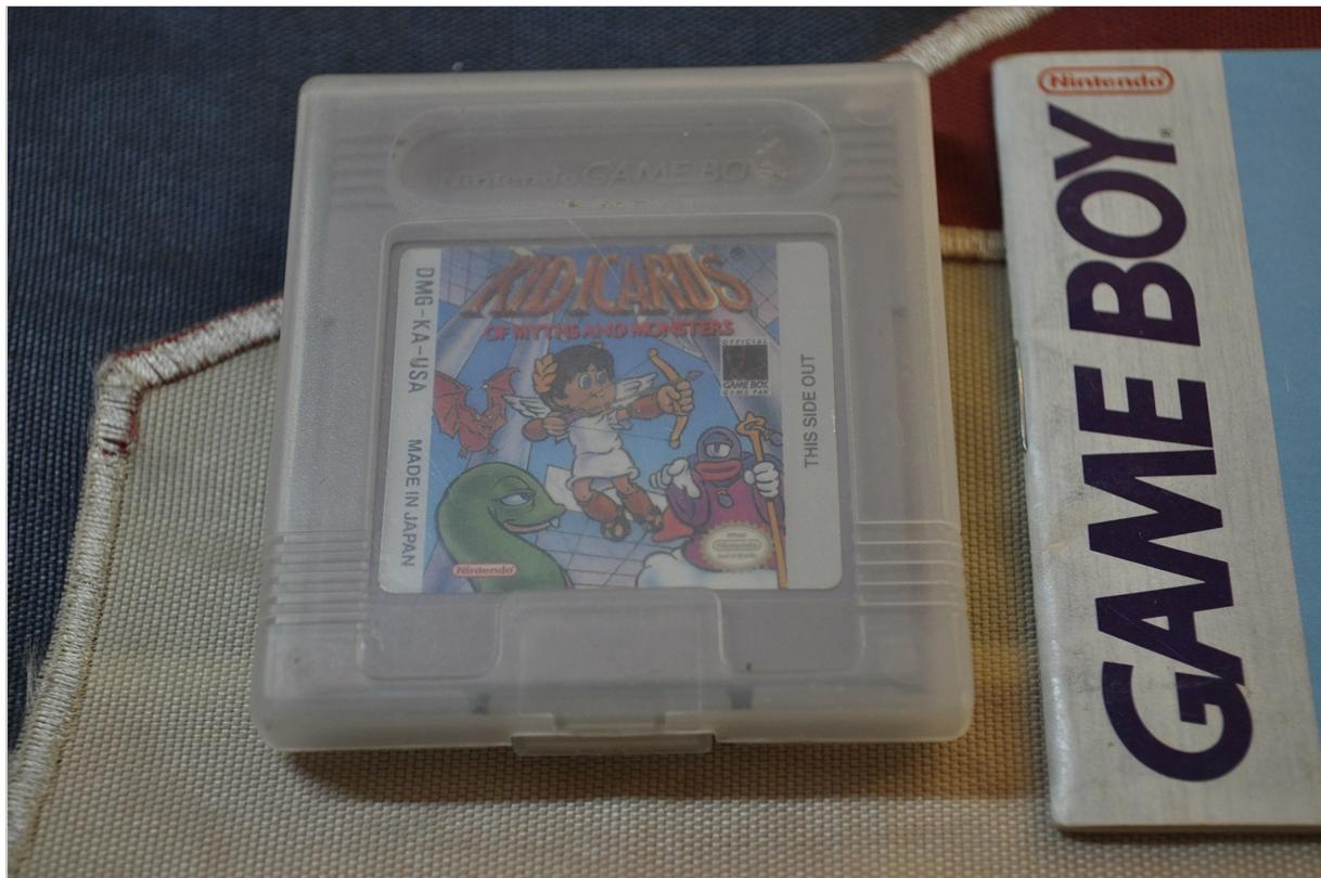
Image: The Kid Icarus: Of Myths and Monsters Game Boy cartridge alongside its instruction booklet.