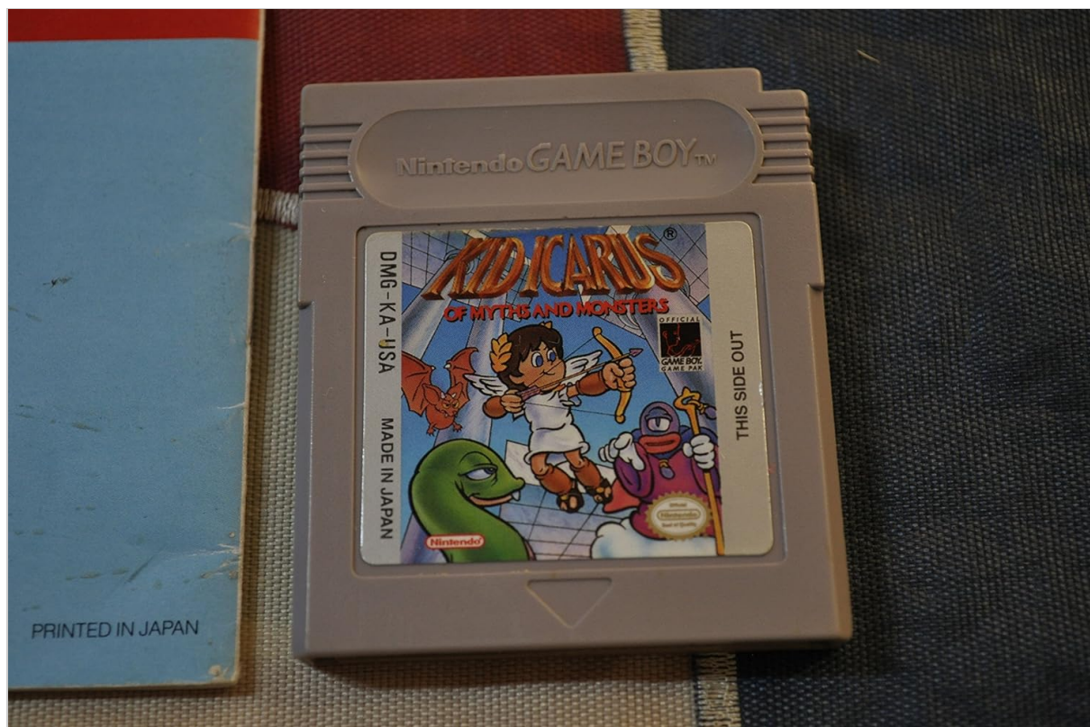
Image: A detailed view of the Kid Icarus: Of Myths and Monsters Game Boy cartridge label.