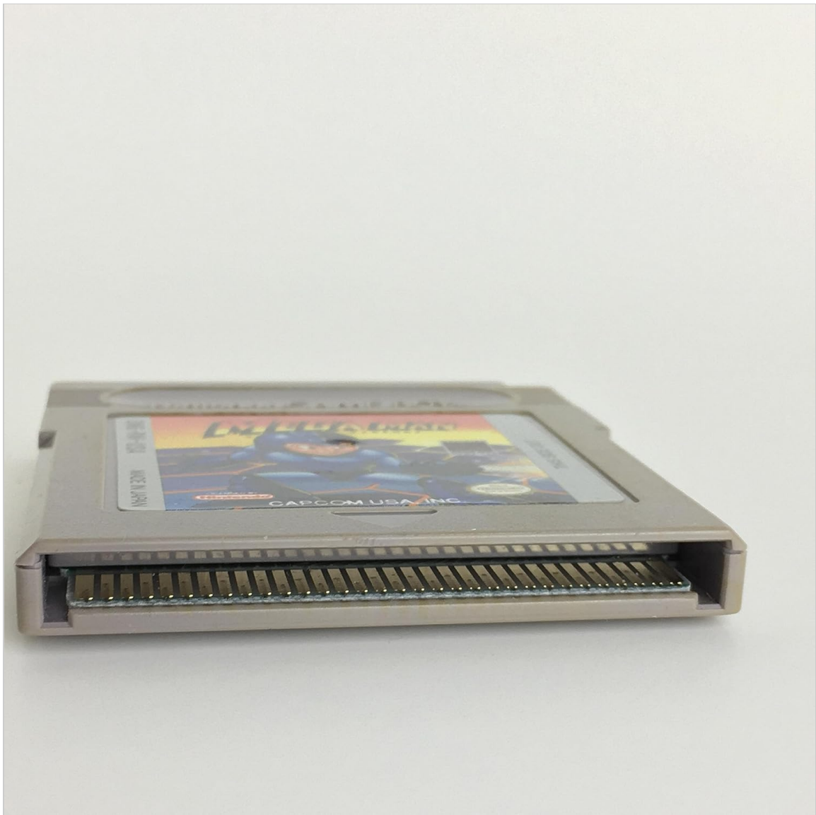
Image: Close-up view of the Game Boy cartridge's connector pins. These pins must be clean and properly aligned for the game to function correctly.