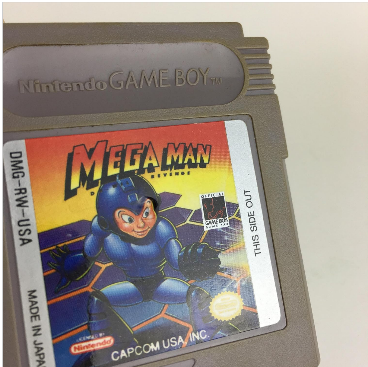
Image: Front label of the Mega Man Game Boy cartridge. This image displays the game's title, "Mega Man," along with character artwork and official Nintendo licensing information.