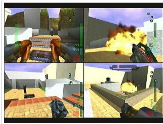
Image: A split-screen view demonstrating four-player multiplayer combat within a game arena.