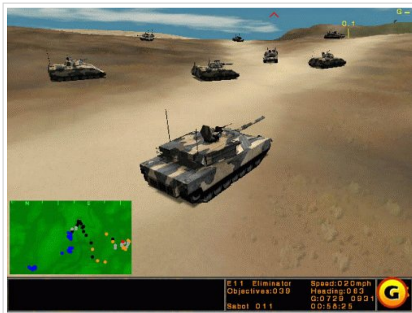
Figure 3: In-Game Tank Formation

The single-player experience includes four distinct campaigns, comprising over 50 missions. These missions involve various objectives, from engaging enemy armor to supporting infantry and coordinating with air assets.