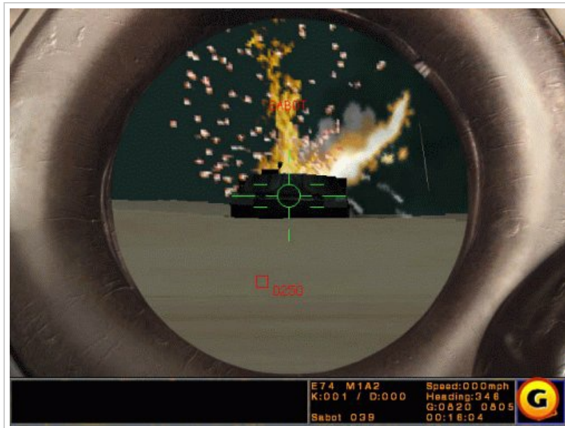
Figure 4: Engaging an Enemy Target