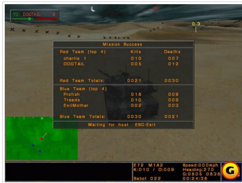
Figure 5: Multiplayer Mission Results Screen