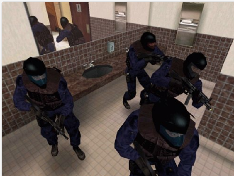
Figure 7: A SWAT team navigating a bathroom environment, highlighting varied mission locations.