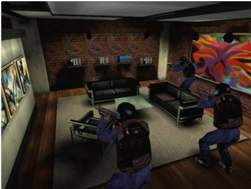
Figure 4: SWAT team members executing a room clear. Coordinated entry and target acquisition are vital.