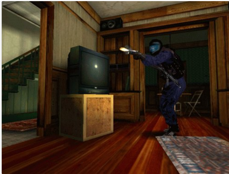
Figure 6: A SWAT officer surveying an environment, demonstrating interaction with in-game objects.