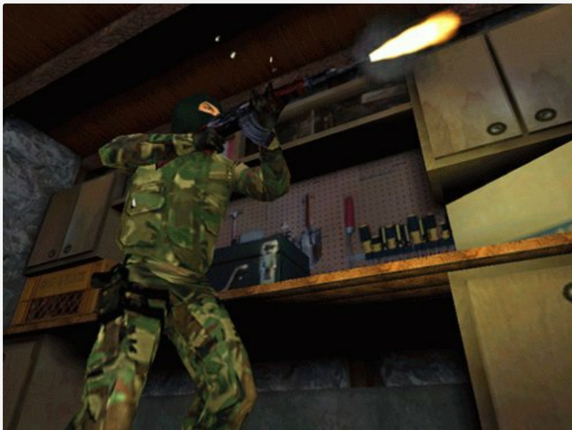
Figure 5: An armed suspect engaging in combat. Players must assess threats and respond appropriately.

Players will encounter various enemy types in diverse environments. Careful observation and strategic engagement are necessary to neutralize threats while minimizing harm to civilians.