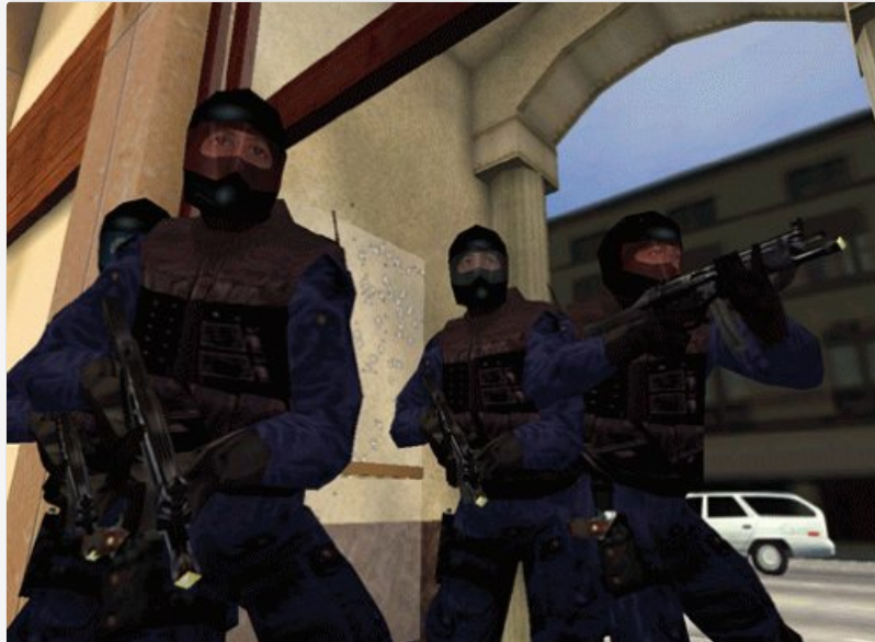
Figure 3: A SWAT team element moving cautiously through a building. Effective team movement is crucial for mission success.