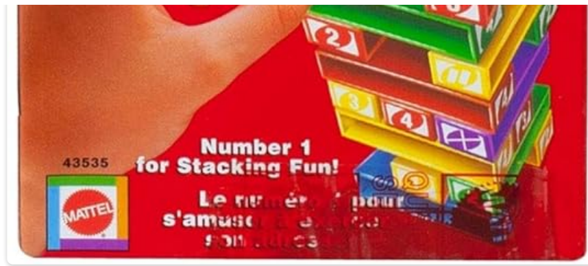
Image: The UNO Stacko game box, illustrating the tower setup and a hand in the process of removing a block.