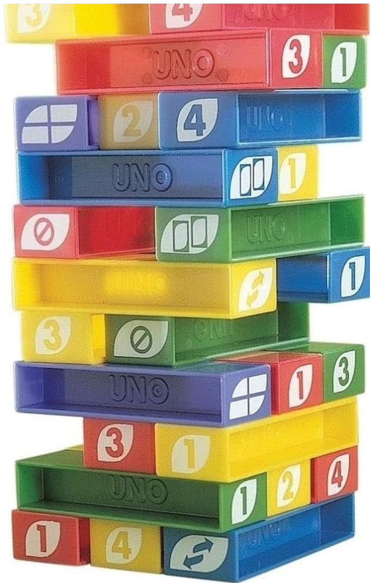
Image: The UNO Stacko tower, showing the colorful blocks with numbers and action symbols. Some blocks are dislodged, indicating the game's challenge.