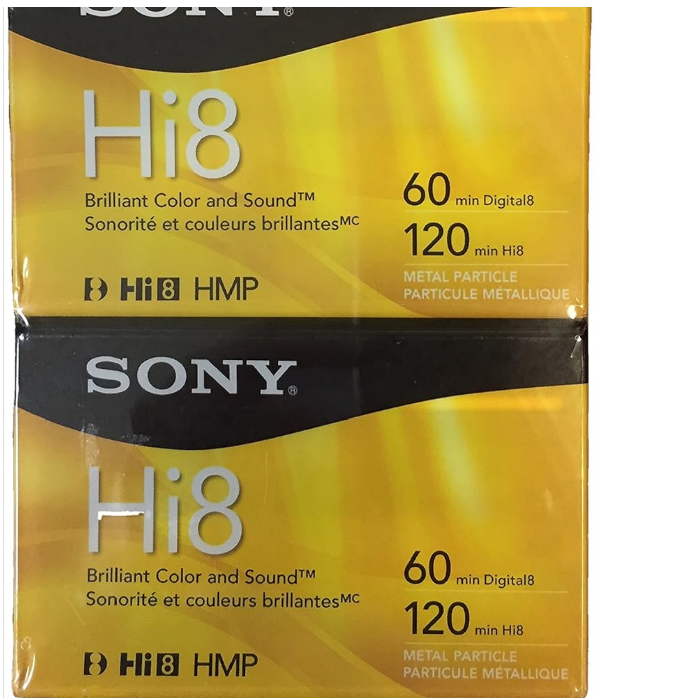
Figure 1: Front view of the Sony Hi-8 HMPD 2-pack video cassette tapes in their retail packaging.