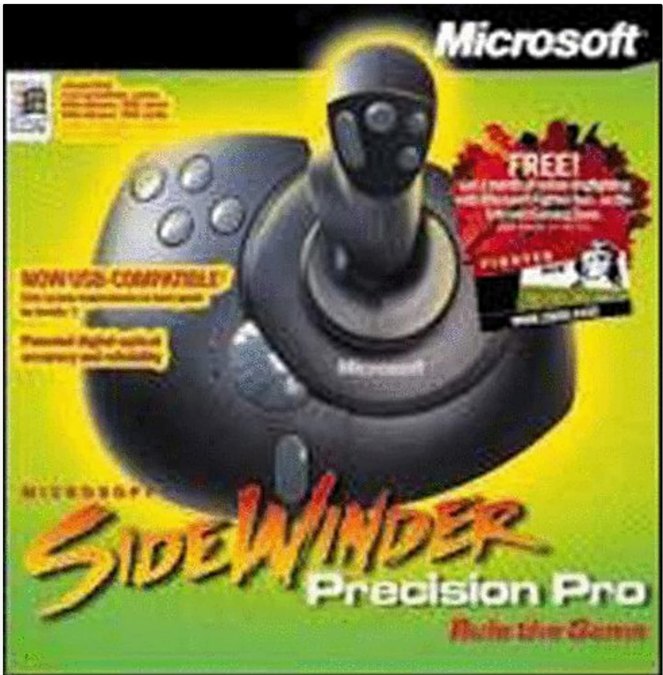
Figure 1: Microsoft Sidewinder Precision Pro Joystick