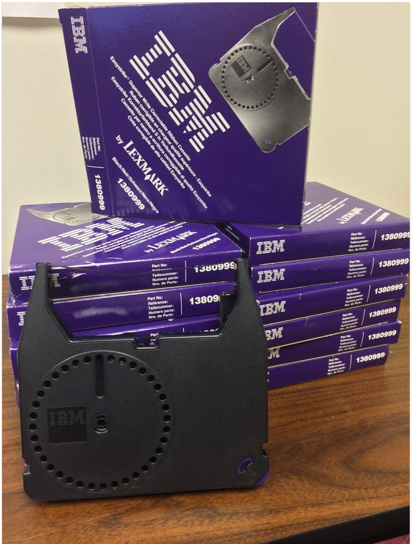
Image 2: The Lexmark 1380999 ribbon cassette, ready for installation into a compatible printer.