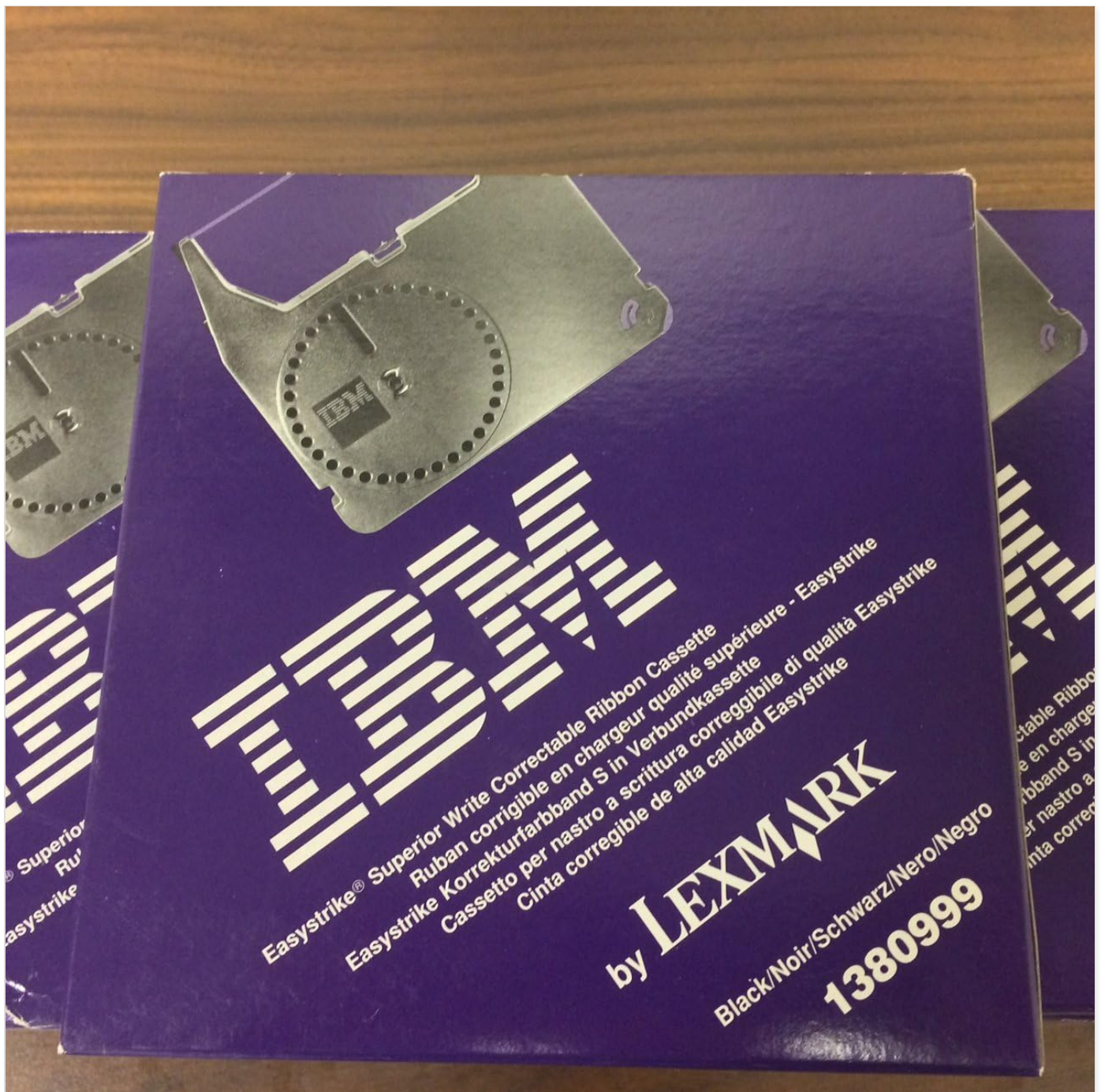
Image 1: Front view of the Lexmark 1380999 Ribbon packaging, showing the IBM logo and Lexmark branding.