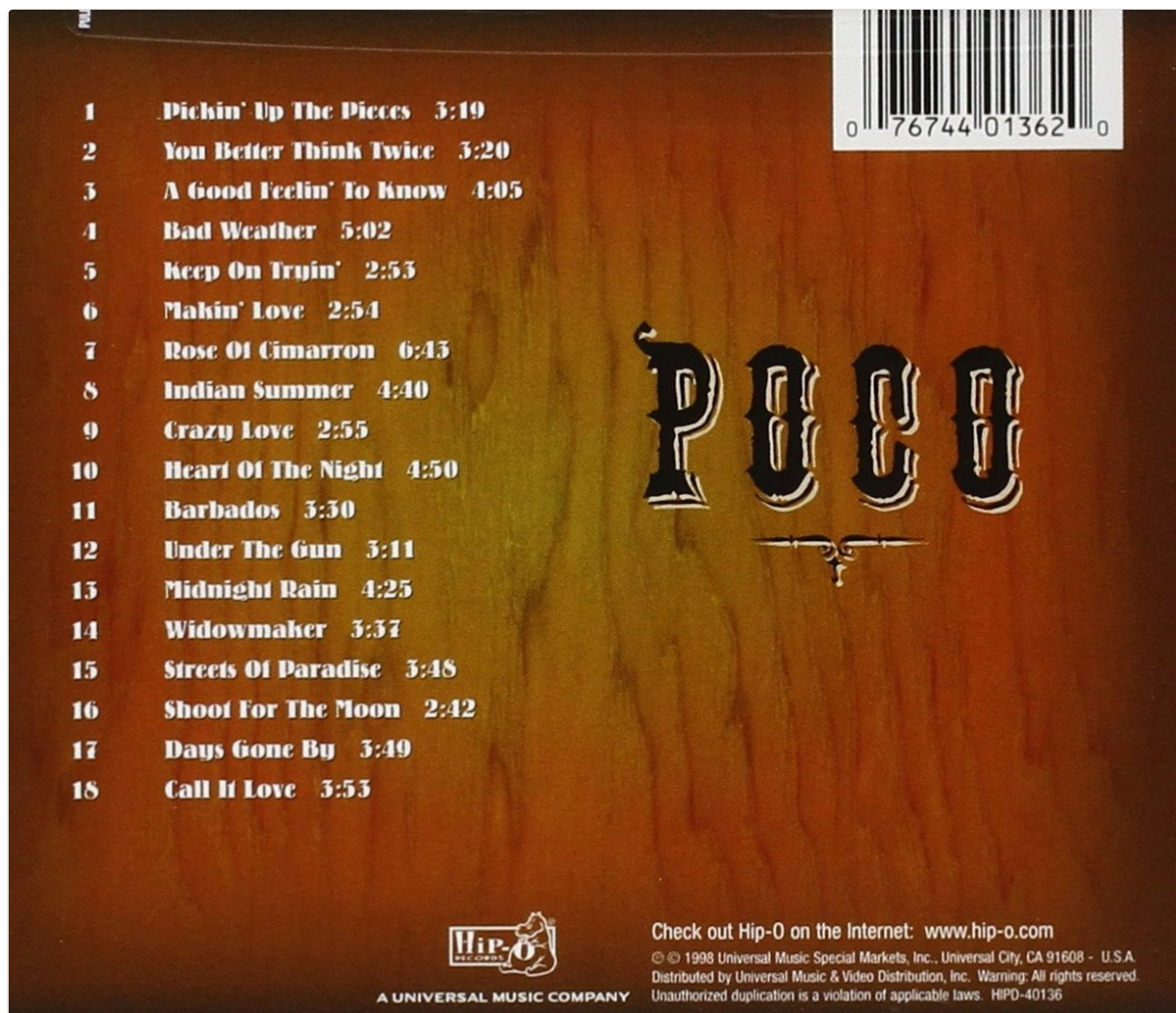
Image 2: Back cover of the Poco Ultimate Collection Audio CD. This image displays the full track list with song titles and durations, along with copyright information and a UPC barcode.