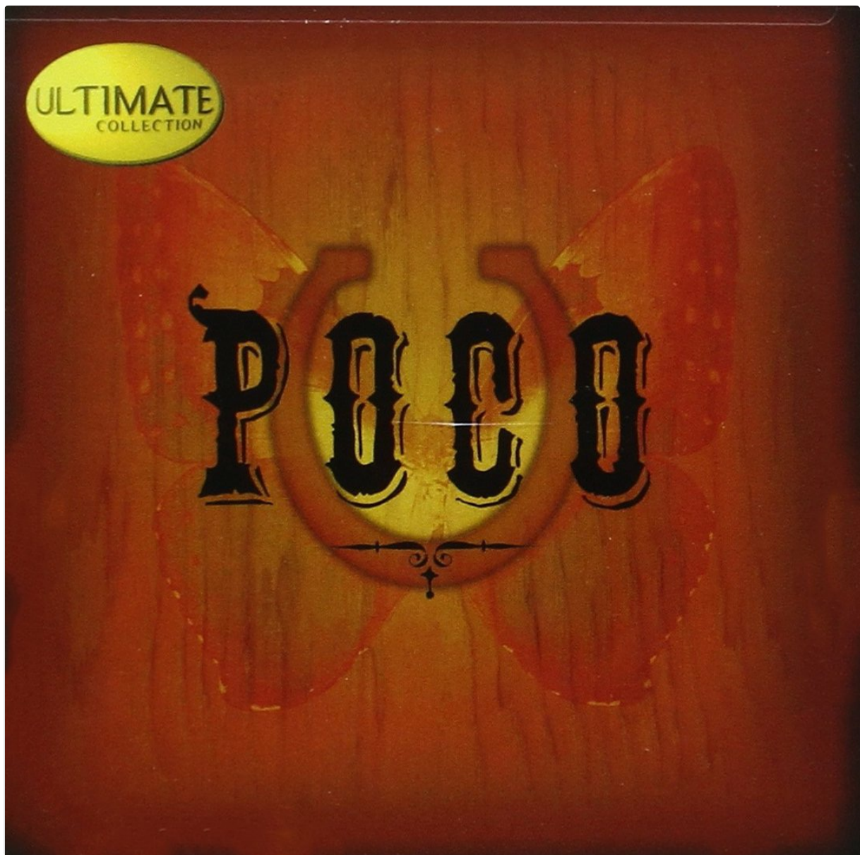
Image 1: Front cover of the Poco Ultimate Collection Audio CD. The cover features the album title "Ultimate Collection" and the band name "Poco" with a horseshoe and butterfly wing design on a wooden background.