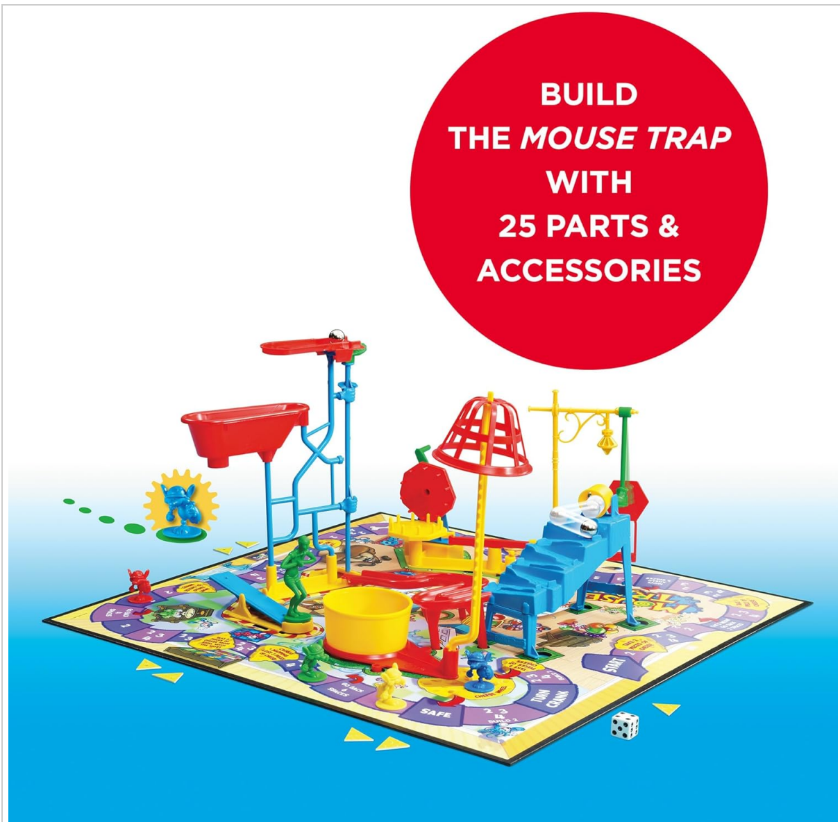
Image: The game board showing several parts of the Mouse Trap contraption already assembled, illustrating the building process.