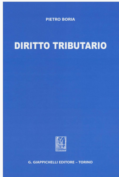
Figure 1: Front Cover

This image displays the front cover of the book 'Tax Law' by Pietro Boria. The cover features the author's name, the title 'DIRITTO TRIBUTARIO', and the publisher's information 'G. GIAPPICHELLI EDITORE – TORINO' on a blue background. A small emblem is also visible in the center.