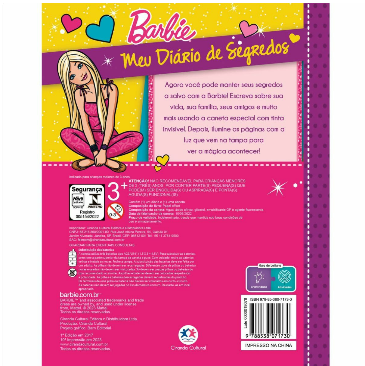
Image 2: Back cover detailing safety warnings and battery replacement instructions.