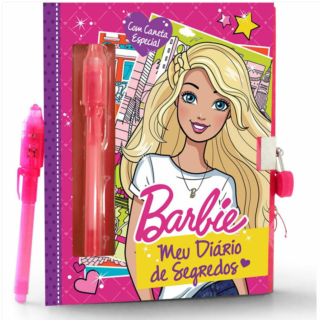
Image 1: The Barbie My Secret Diary with its special invisible ink pen.