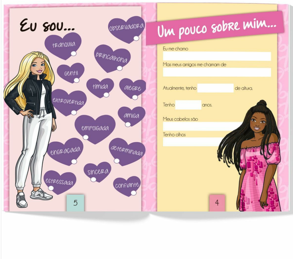
Image 3: Example of internal diary pages, including 'About Me' sections.