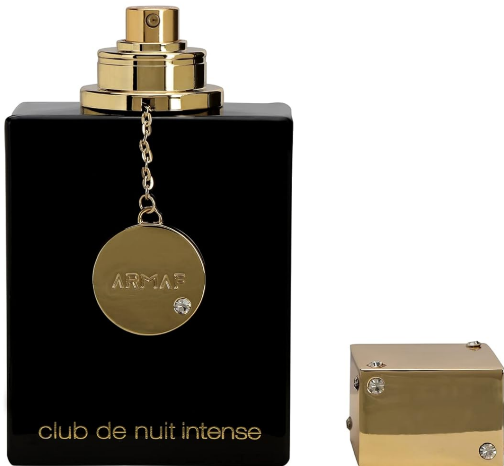
Figure 5.1: The perfume bottle with its cap removed, illustrating the spray mechanism for application.