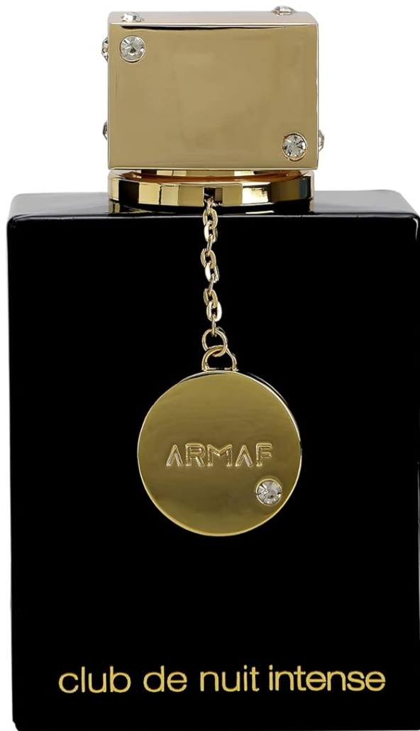
Figure 1.1: Front view of the Armaf Club De Nuit Intense for Women Eau De Parfum Spray bottle. This image displays the elegant black bottle with gold accents and the 'Armaf' logo.