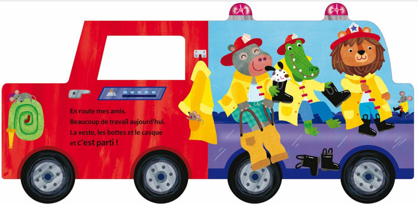
An interior spread illustrates the animal firefighters, including a hippo, alligator, and lion, preparing for action. They are shown putting on their yellow raincoats and boots, ready to respond to an emergency. Text on the left page encourages them to get ready for work.