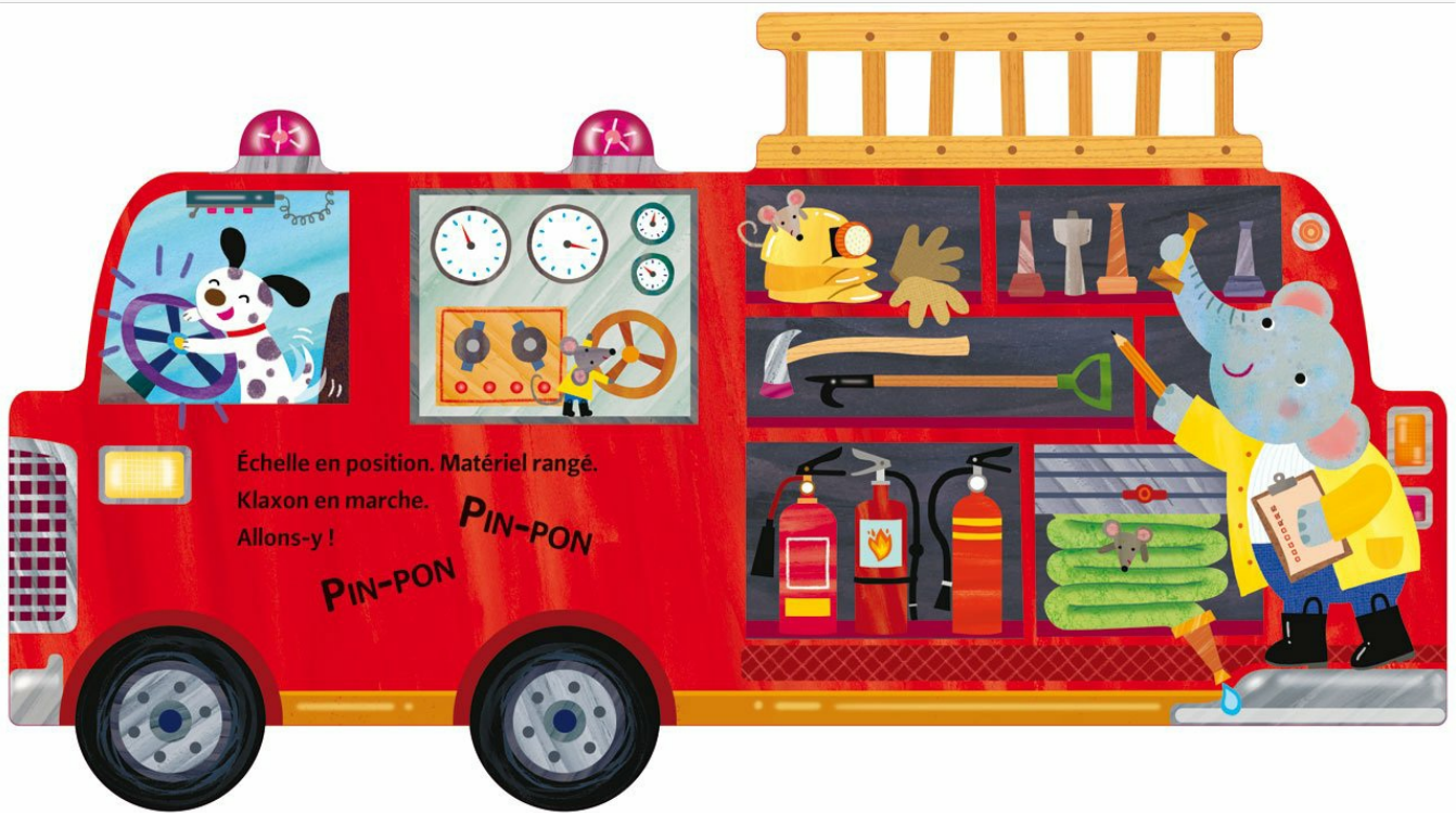
Another internal page displays the inside of the fire truck. A small dog is at the steering wheel, while a mouse operates the controls. Various firefighting tools and equipment, such as axes, shovels, fire extinguishers, and rolled-up hoses, are neatly stored in compartments within the truck.