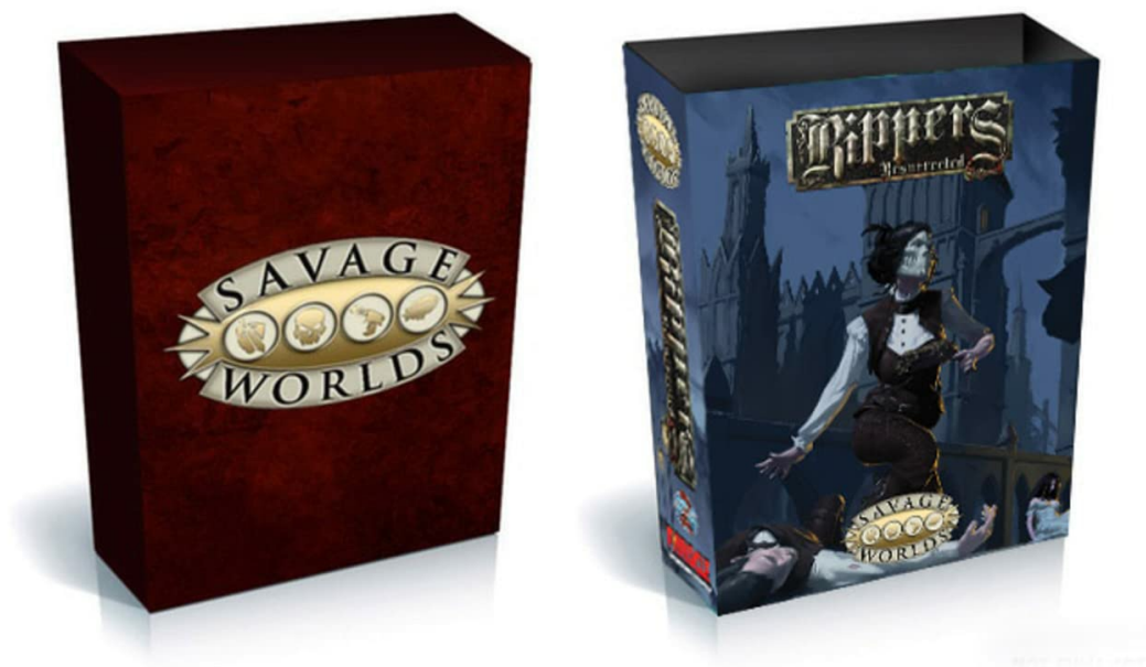
Image: The Savage Worlds Rippers Resurrected Collector's Box, featuring its distinct packaging and thematic artwork.