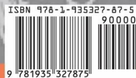
Image: Back cover of the manual, displaying additional aircraft images, a summary of the B-36's history, and publication details including ISBN 978-1935327875.