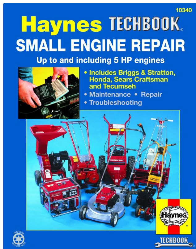
Figure 1.1: Front cover of the Haynes TECHBOOK Small Engine Repair manual. This image displays the title, "Haynes TECHBOOK Small Engine Repair," and indicates its applicability to engines up to 5 HP. It also highlights coverage for brands like Briggs & Stratton, Honda, Sears Craftsman, and Tecumseh, emphasizing maintenance, repair, and troubleshooting.

The manual covers various engine types, including those from Briggs & Stratton, Honda, Sears Craftsman, and Tecumseh. Its content is structured to guide users through troubleshooting, maintenance, and complete overhaul processes.