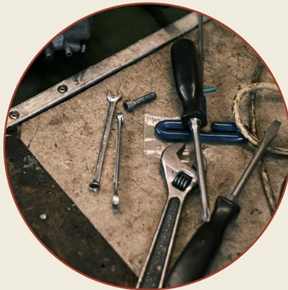
Figure 3.1: A collection of common hand tools on a workbench, illustrating the variety of fastening and shaping tools covered in the guide.