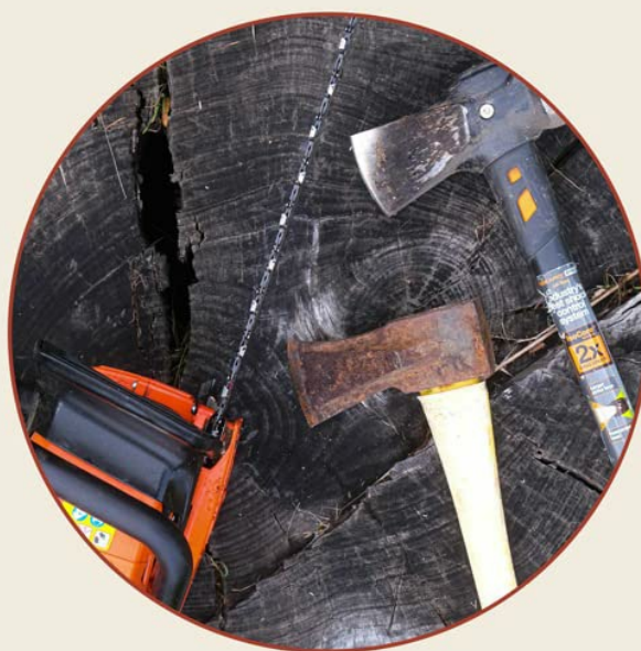
Figure 2.1: An example of cutting tools, including a chainsaw and an axe. The guide covers a wide array of tools across different functions.