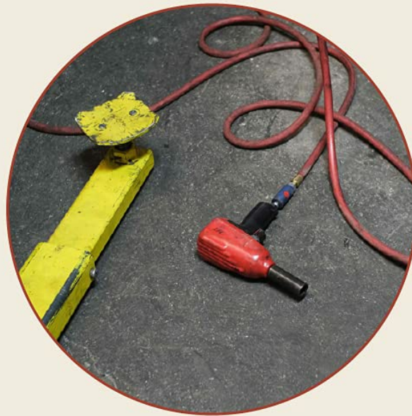
Figure 4.1: Specialized tools like a car jack and an air tool. Proper care extends the life of both tools and reference materials.