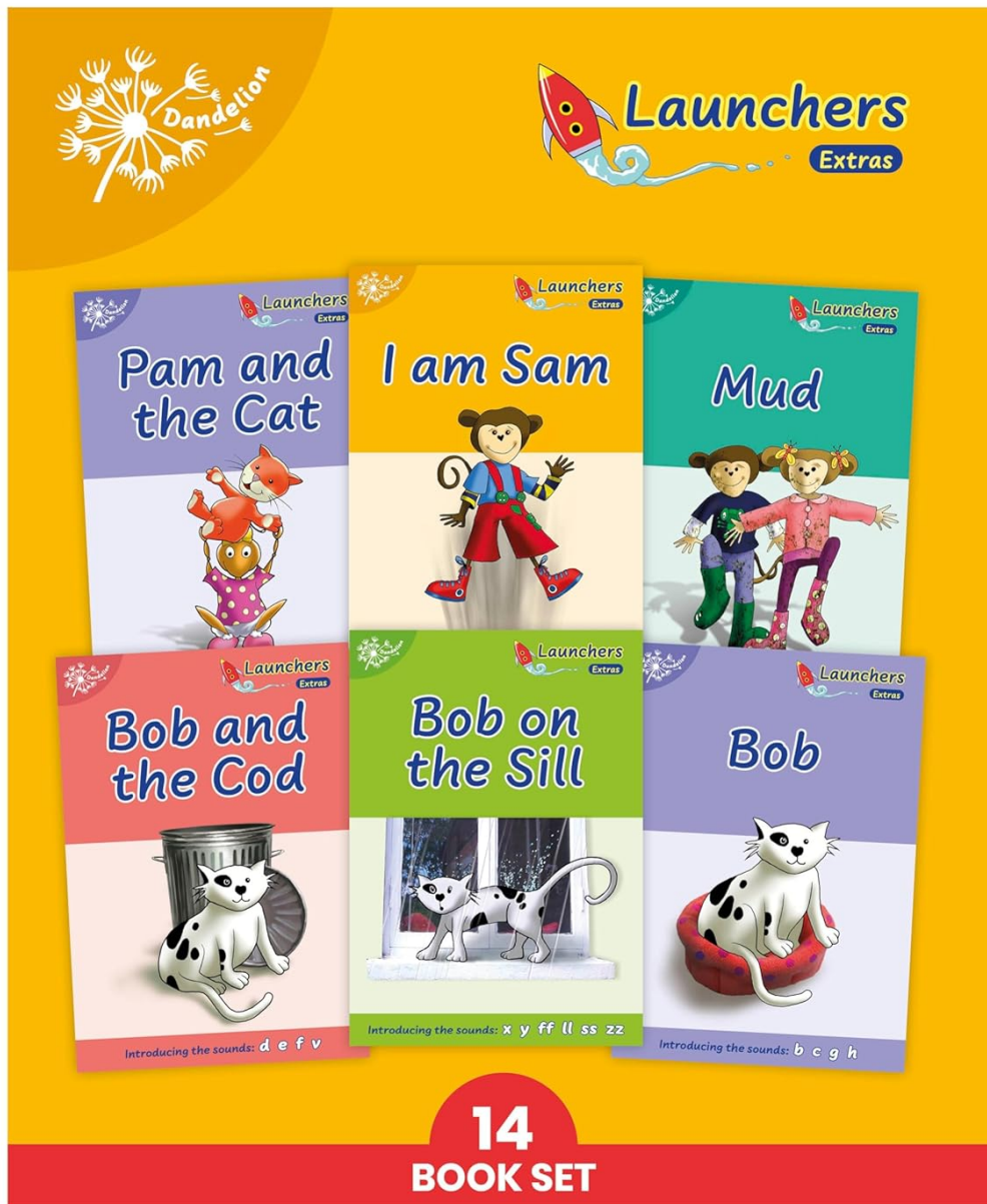
Image 1.1: The complete 14-book set of Dandelion Launchers Extras Stages 1-7.