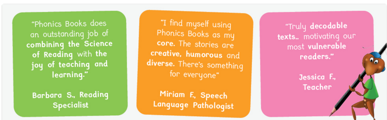
Image 1.2: An illustration highlighting the decodable nature of the book series for beginner readers.