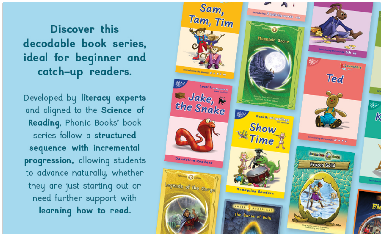
Image 2.1: An overview of various Dandelion Launchers book covers, illustrating the series progression.