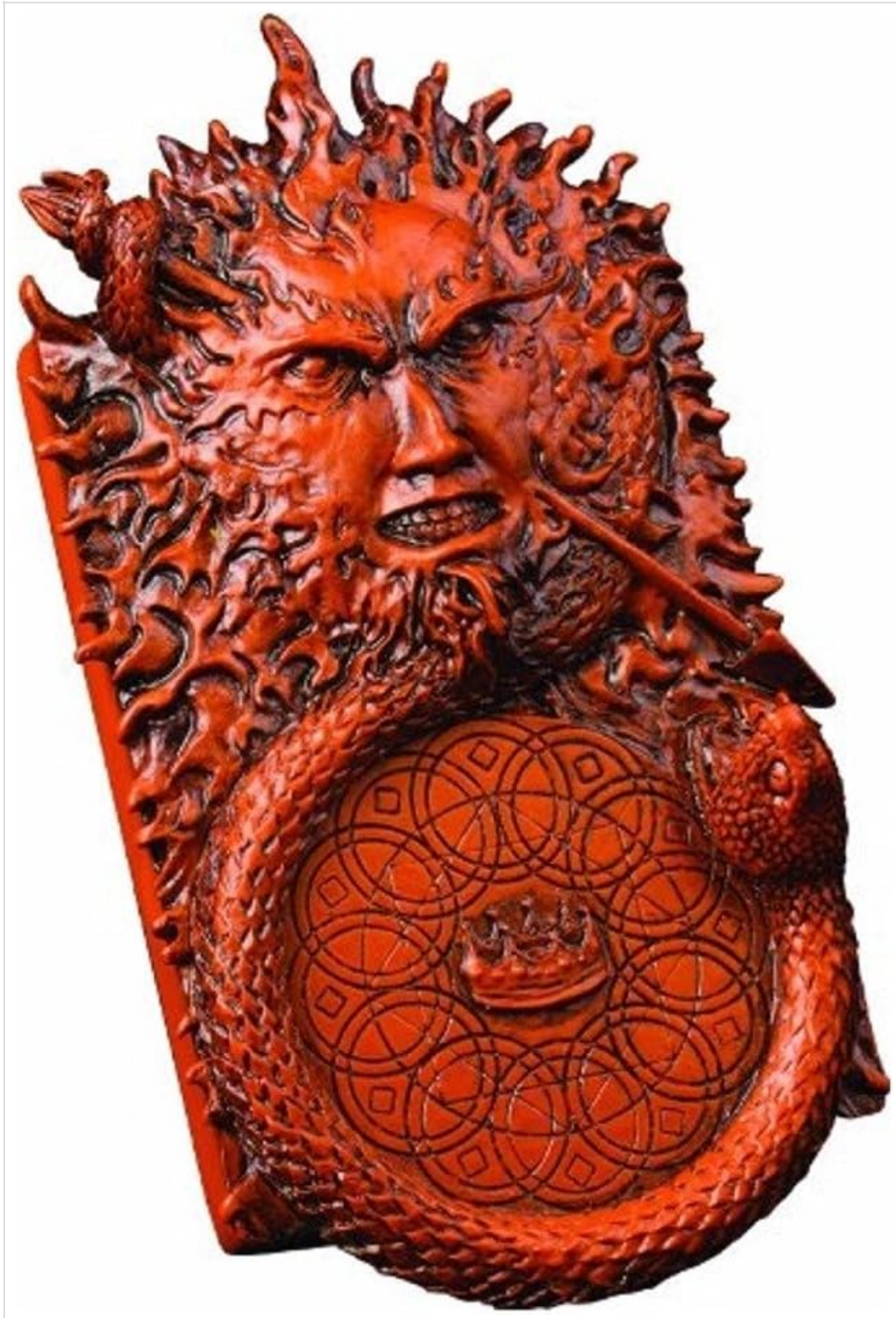
Image 2: Detailed view of the Martell Resin House Card, showcasing its sculpted design.