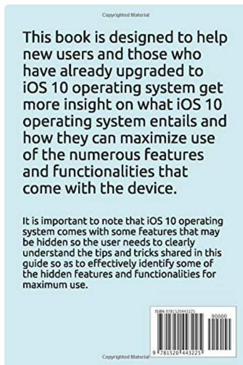
Image: Back cover of the "Guide on Apple's iOS 10 Operating System" book. This image provides additional details about the book's content and publication information, reinforcing its role as a comprehensive user guide.