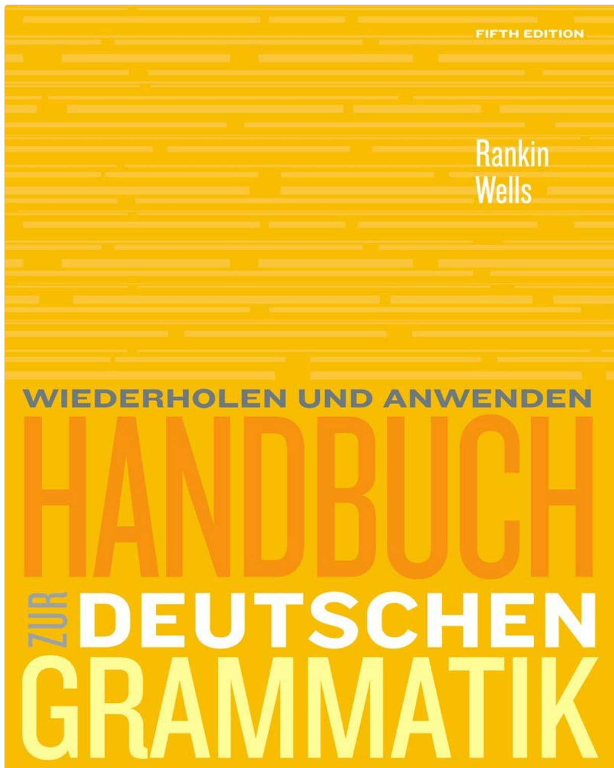
Image 1: Front cover of the Handbuch zur deutschen Grammatik . The cover features a vibrant yellow background with the title in bold, orange and white lettering, indicating 'Wiederholen und Anwenden Handbuch zur deutschen Grammatik'. The authors' names, Rankin and Wells, are also visible, along with 'Fifth Edition' at the top right.