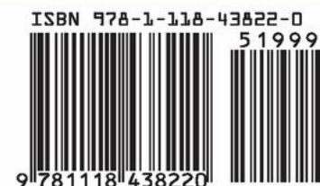
Image: Back cover of the Nikon D3200 Digital Field Guide, highlighting key features covered in the book such as mastering buttons, lenses, focus modes, and shooting advice.