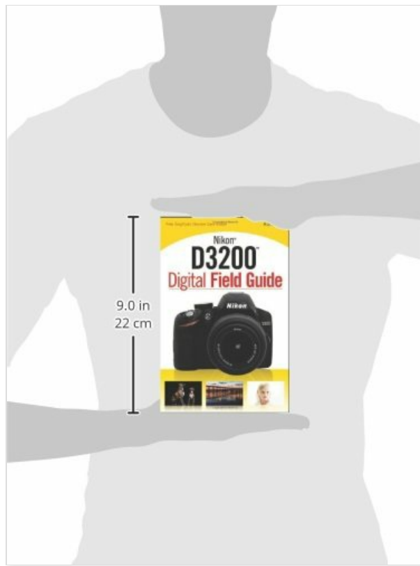
Image: Side view of the Nikon D3200 Digital Field Guide, illustrating its dimensions (9.0 inches or 22 cm in height) for portability.