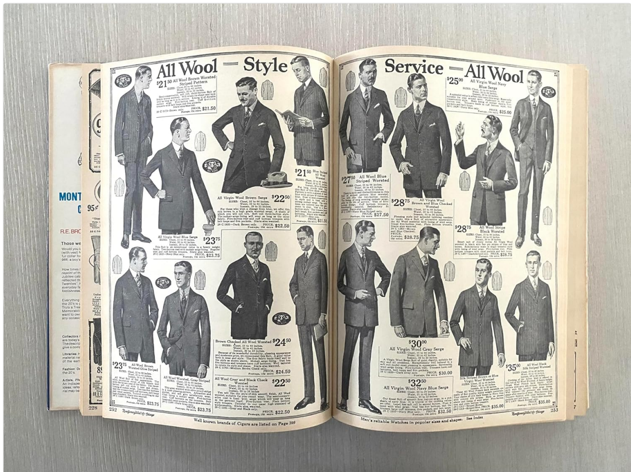
Image: Another open spread from the catalogue, focusing on men's fashion. It showcases various styles of wool suits and overcoats, providing a visual record of early 20th-century attire and associated costs.

metal-top kitchen table, complete with original pricing and descriptions. This page highlights the range of household items available.