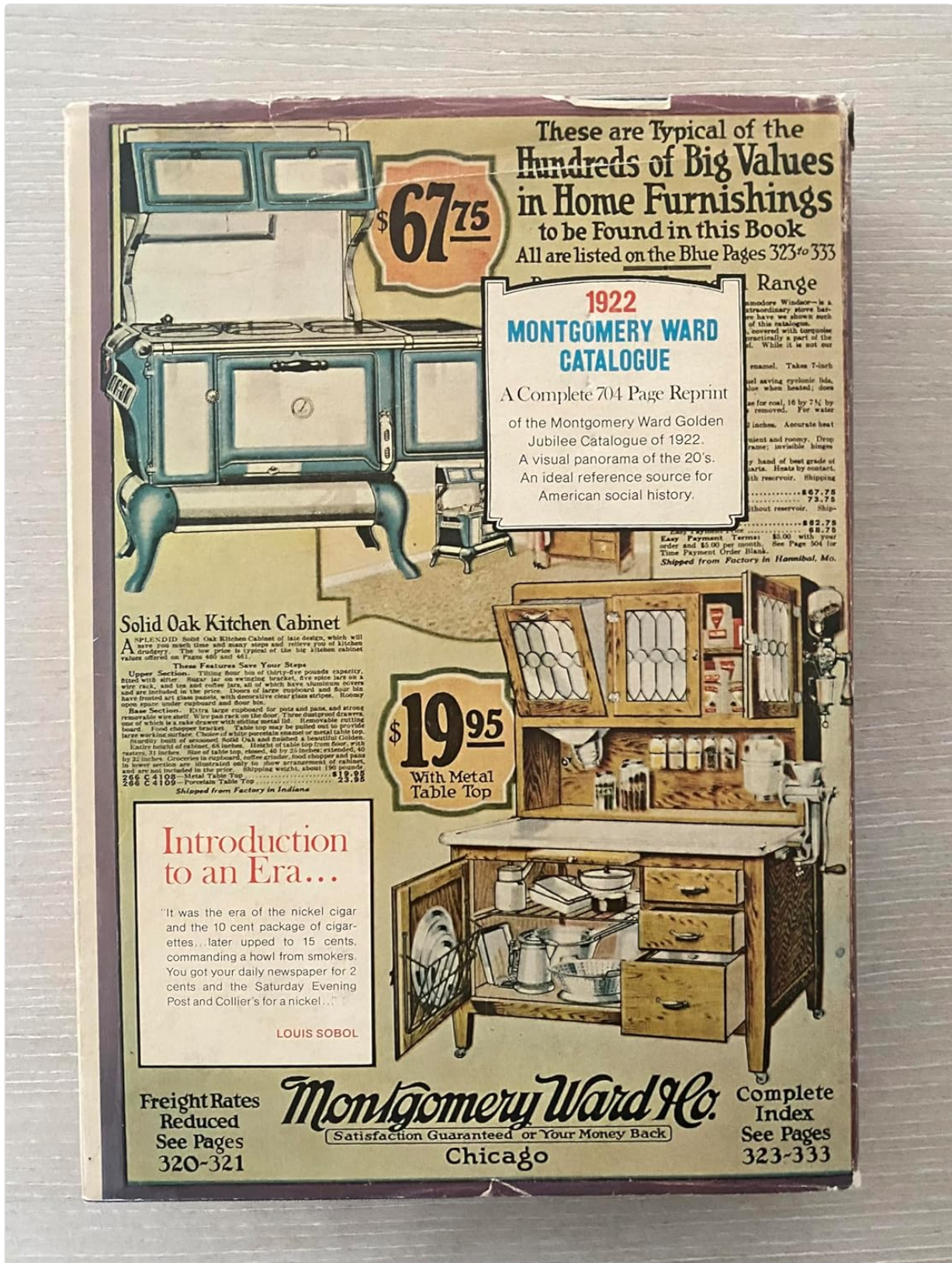
Image: An open spread of the catalogue displaying various home furnishings, such as a solid oak kitchen cabinet and a