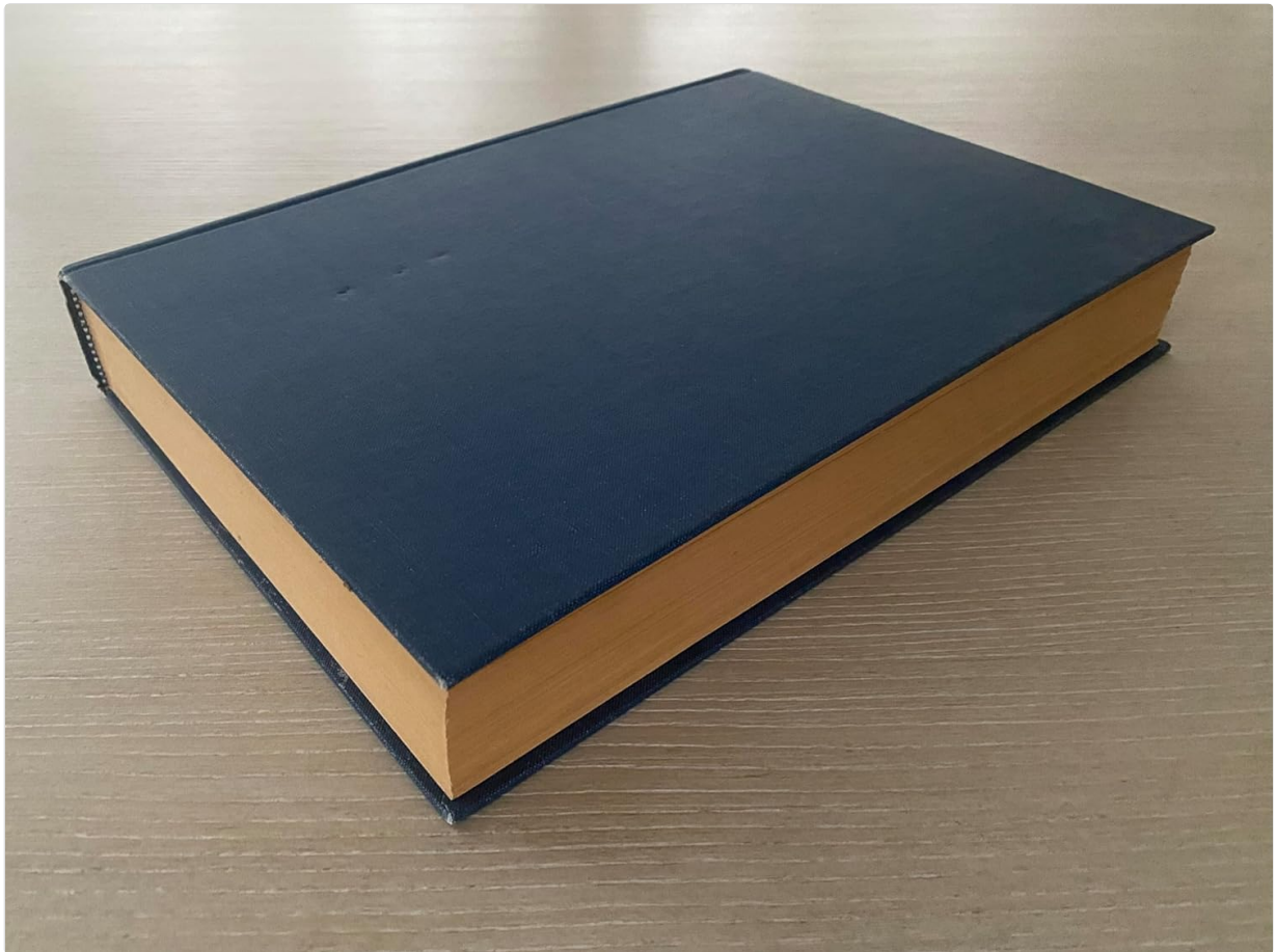
Image: Top-down view of the closed hardcover book, highlighting its sturdy construction and the classic blue cover with golden page edges.