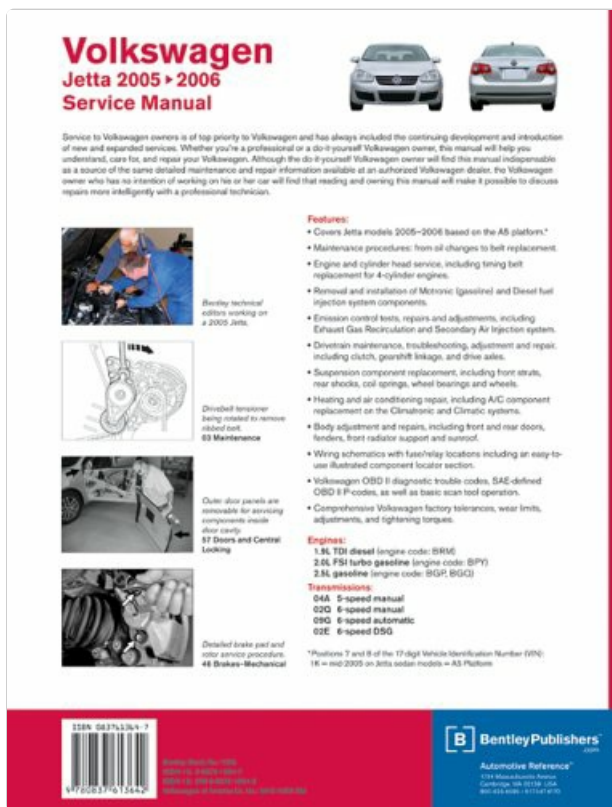
Image: Back cover of the Volkswagen Jetta Service Manual, displaying a list of covered topics and features, including engine and transmission types, and diagnostic information.