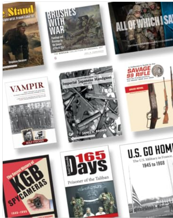
Figure 4: A selection of other titles published by Schiffer Military History.