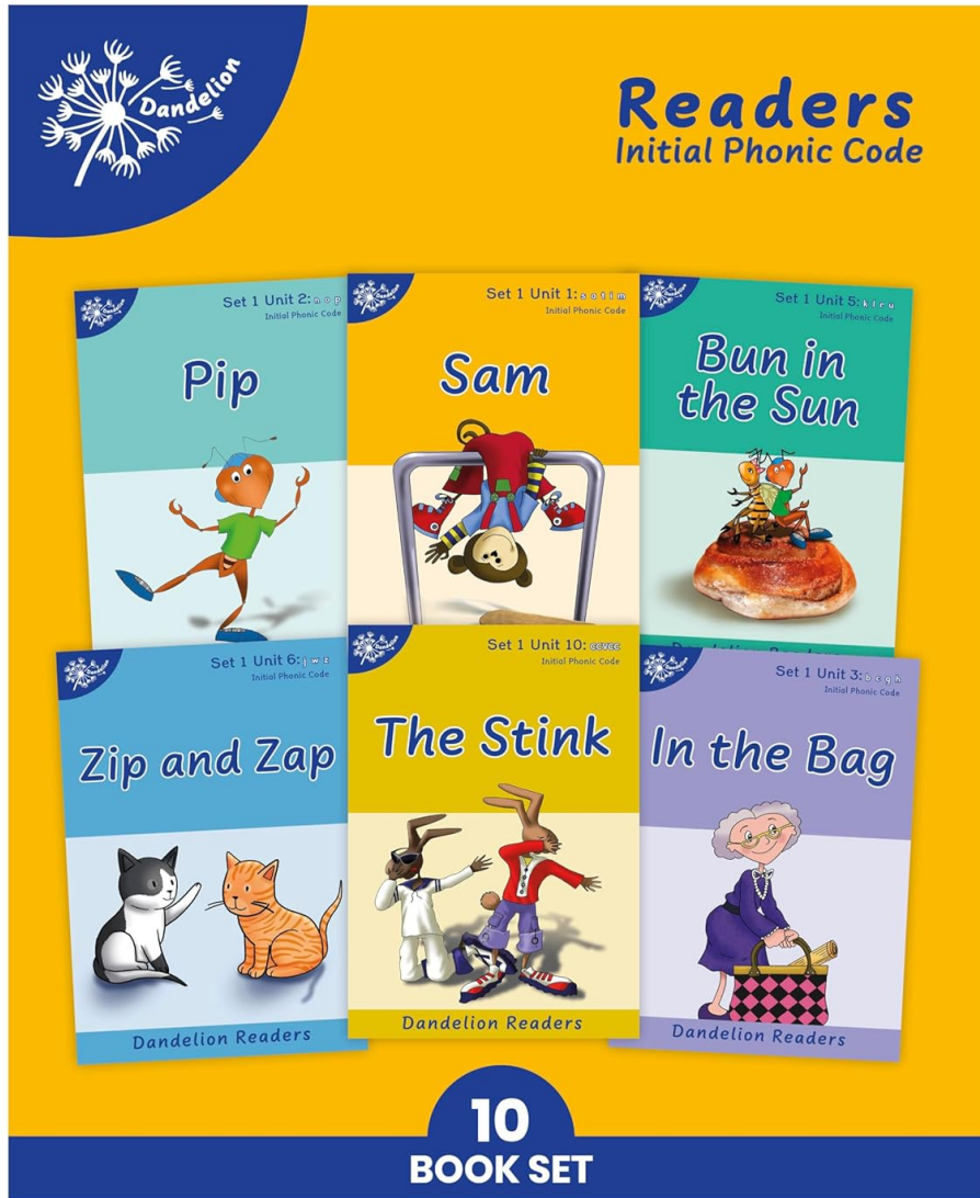
Image: The complete Phonic Books Dandelion Readers Set 1, featuring the covers of all ten books.