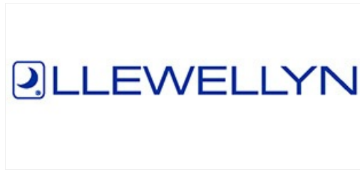
Image 2.1: The logo for Llewellyn Publications, featuring a crescent moon symbol and the company name.

particular emphasis on Thelema. The book is published by Llewellyn Publications, a renowned publisher in the body, mind, and spirit genre since 1901.