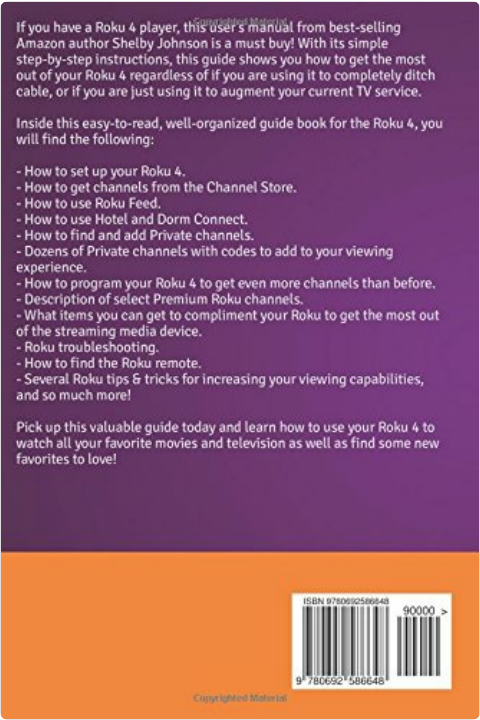
Image: Back cover of the guide, detailing the topics covered within the manual.