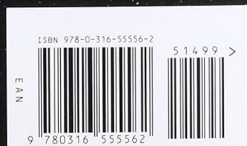
Figure 2: Back cover of "Revenger", providing additional insights into the story and critical acclaim.