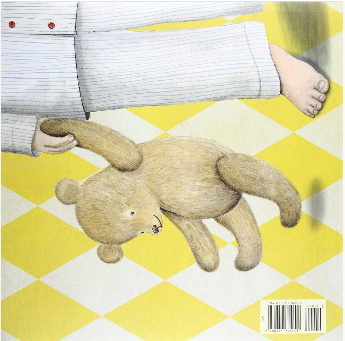
Image: Back cover of the book, illustrating a child's hand holding a teddy bear, symbolizing the inspiration for Winnie-the-Pooh.