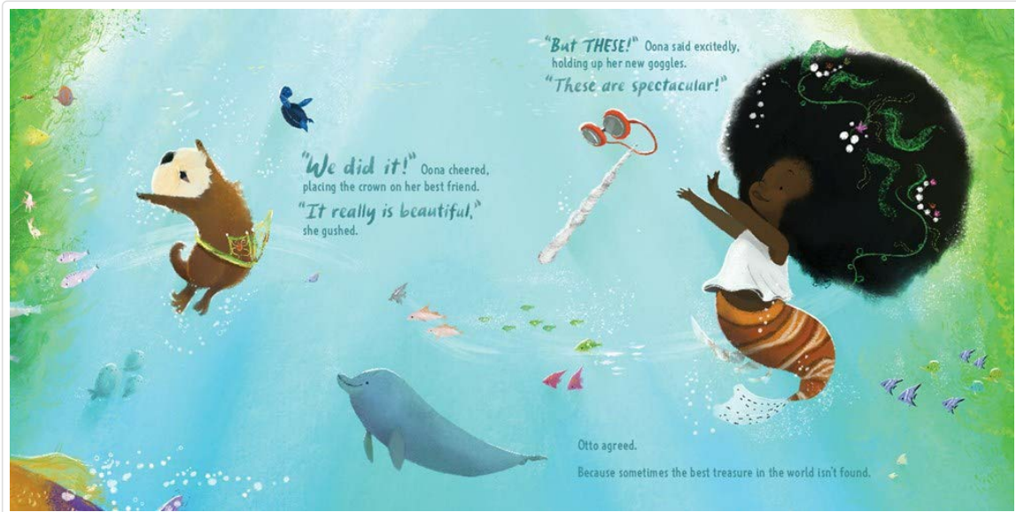
Image 5: The final illustration shows Oona and Otto celebrating their success with new goggles, surrounded by marine life including a dolphin, symbolizing the joy of discovery and the value of friendship over material treasures.

mysterious rift, adding an element of unexpected adventure to her quest.