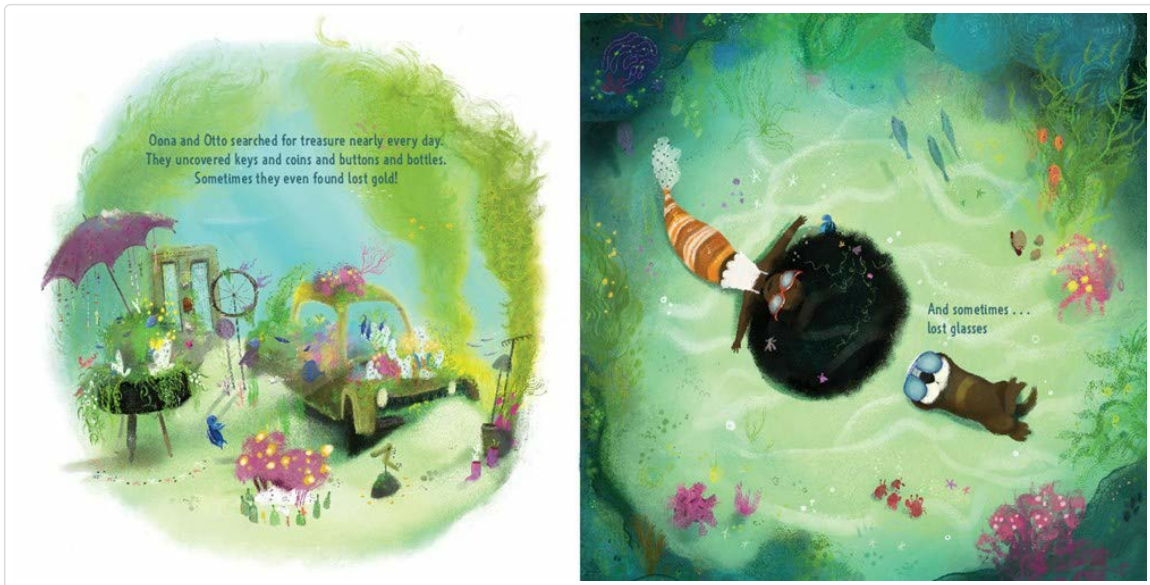
Image 2: An illustration depicting Oona and Otto on one of their treasure hunts, discovering various items including a partially submerged car and a pair of lost glasses, highlighting their adventurous spirit.