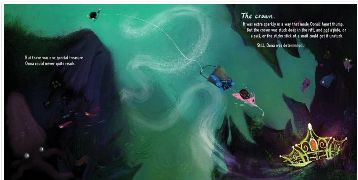
Image 3: This image shows Oona's determined efforts to retrieve a glittering crown from a dark, deep underwater rift, illustrating her perseverance in the face of a challenging goal.