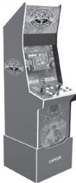
STREET FIGHTER™ II BIG BLUE ARCADE1UP