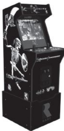
KILLER INSTINCT ARCADE1UP