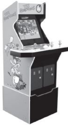
THE SIMPSONS ARCADE1UP