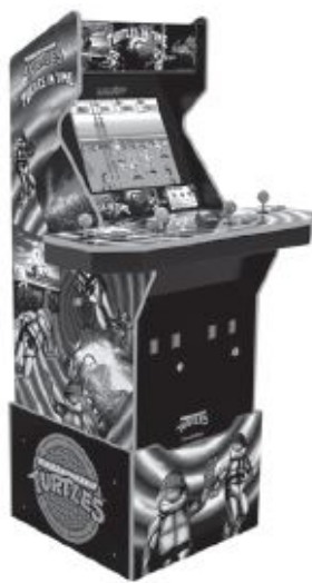
TURTLES IN TIME ARCADE1UP