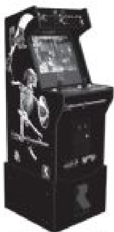
KILLER INSTINCT ARCADE1UP