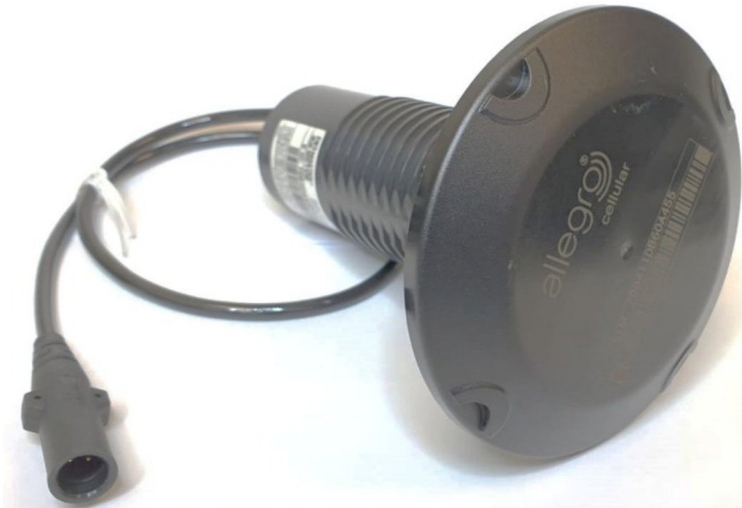
Figure 1 – Allegro Cellular PIT Module