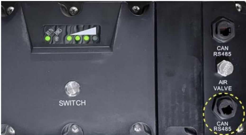
a CAN port

6. Power your Guardian with the white plug-in power adapter.