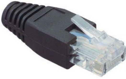
Terminating resistor plug