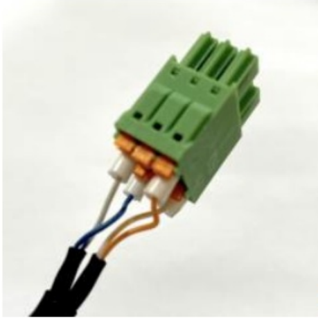
Green 6-pin cable end