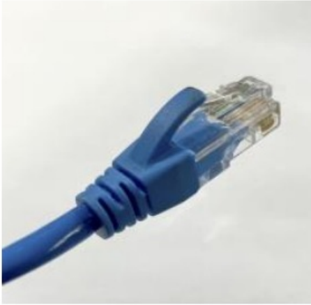
RJ45 end of wire