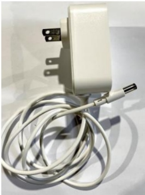
the white plug-in power cable

6. Power your Guardian with the white plug-in power adapter.