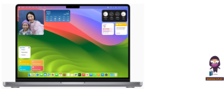
Apple New Features Available With macOS Sonoma