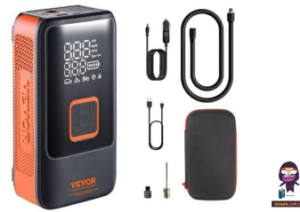
Anykit D55R Car Tire Inflator